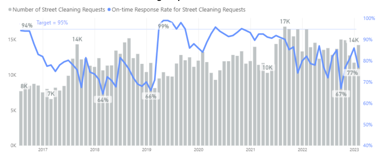
Exhibit 1: Street and Sidewalk Cleaning Response Performance