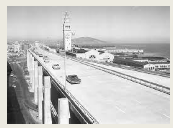
Embarcadero Blvd before Freeway Removal