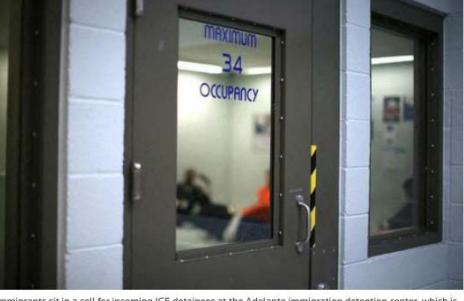
Immigrants sit in a cell for incoming ICE detainees at the Adelanto immigration detention center, which is run by the Geo Group, in Adelanto, California, U.S., April 13, 2017.