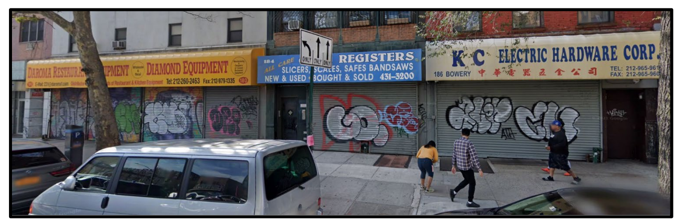
Rolldown Gates in Manhattan

When studying other cities' transparency requirements, staff found that many cities with less stringent transparency requirements struggle with vandalism of security gates. Solid gates provide an easy surface for tagging with graffiti. This problem has become so widespread in New York City that in 2009 the city council passed a law requiring all rolldown gates to be at least 70% transparent. The law requires all rolldown gates in the city to comply with the transparency requirement by 2026.