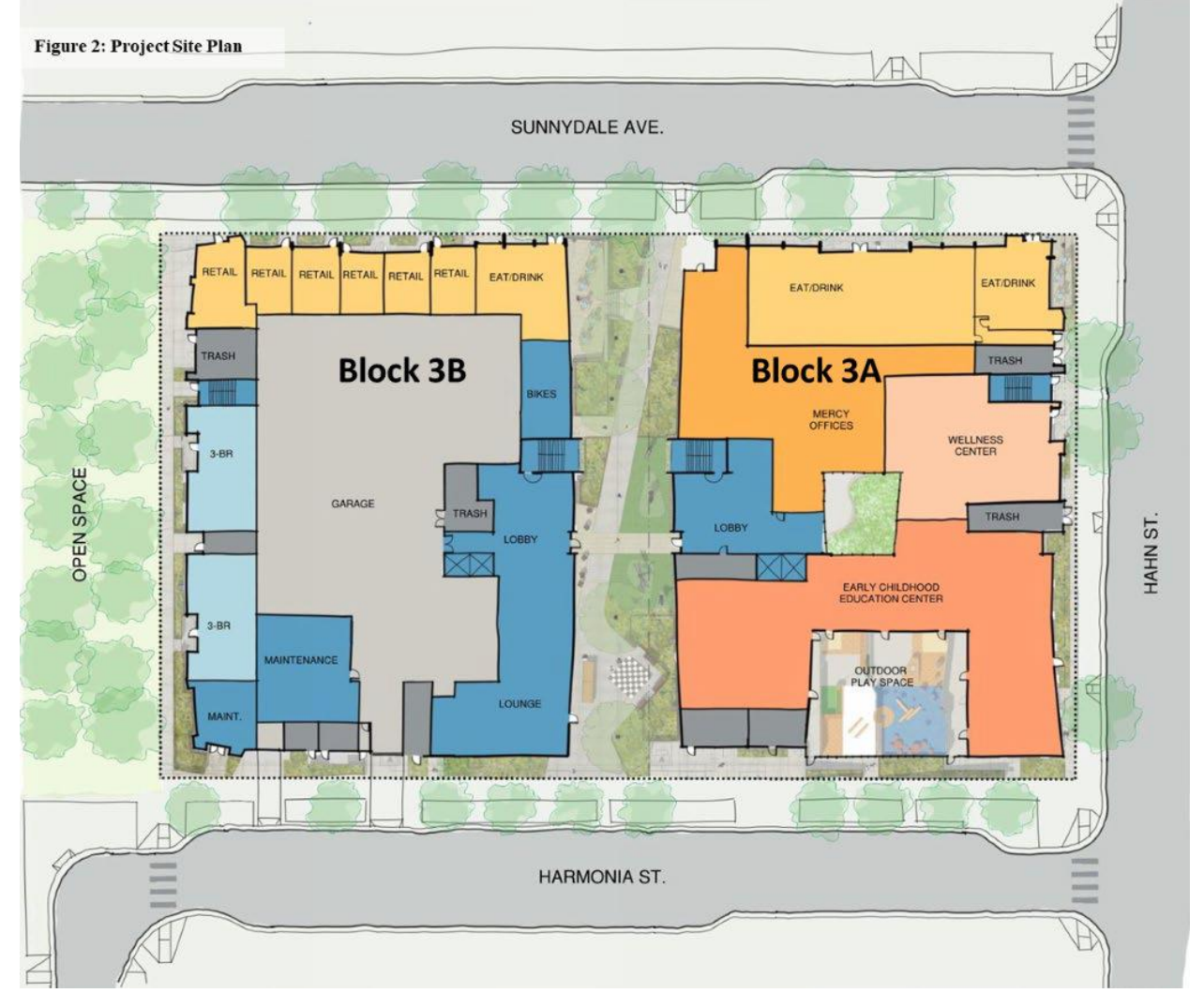
Exhibit 2: Sunnydale HOPE SF Blocks 3A and 3B