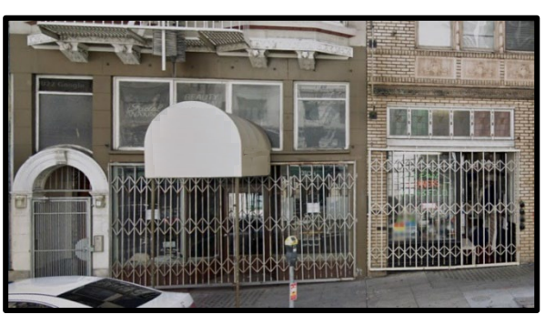
Gates Allowed Under Proposed Ordinance for Any Cannabis Retail Use or Non-Residential Use with an Existing Non-Compliant Gate: