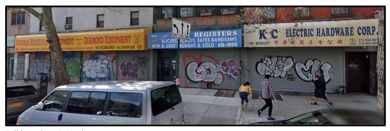
Rolldown Gates in Manhattan

When studying other cities' transparency requirements, staff found that many cities with less stringent transparency requirements struggle with vandalism of security gates. Solid gates provide an easy surface for tagging with graffiti. This problem has become so widespread in New York City that in 2009 the city council passed a law requiring all rolldown gates to be at least 70% transparent. The law requires all rolldown gates in the city to comply with the transparency requirement by 2026.