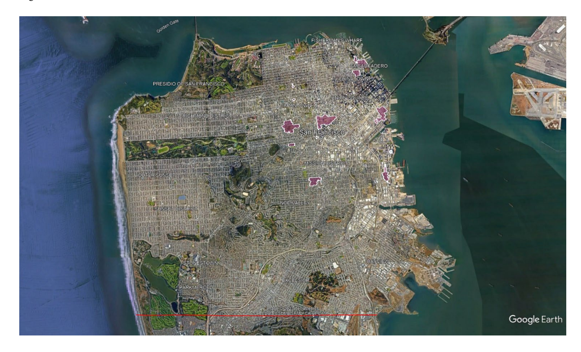
Figure 1. Article 10 historic districts (shaded in purple, adapted from DataSF) – Proposed ordinance would apply in less than 1% of total San Francisco area (affecting only a few parcels in that < 1% area – just those that otherwise would have been proposed for HOME-SF).