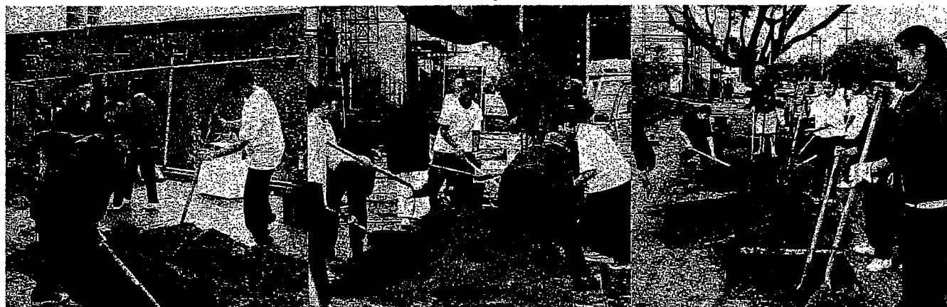
DURING: DECEMBER, 1999 - Students transforming the Streetscape and creating new California Native Uplands Learning Zone by digging holes and planting drought tolerant California Native Trees at OMI/ Excelsior Living Library & Think Park in front of James Denman Middle School and behind San Miguel Child Development Center, San Francisco, California