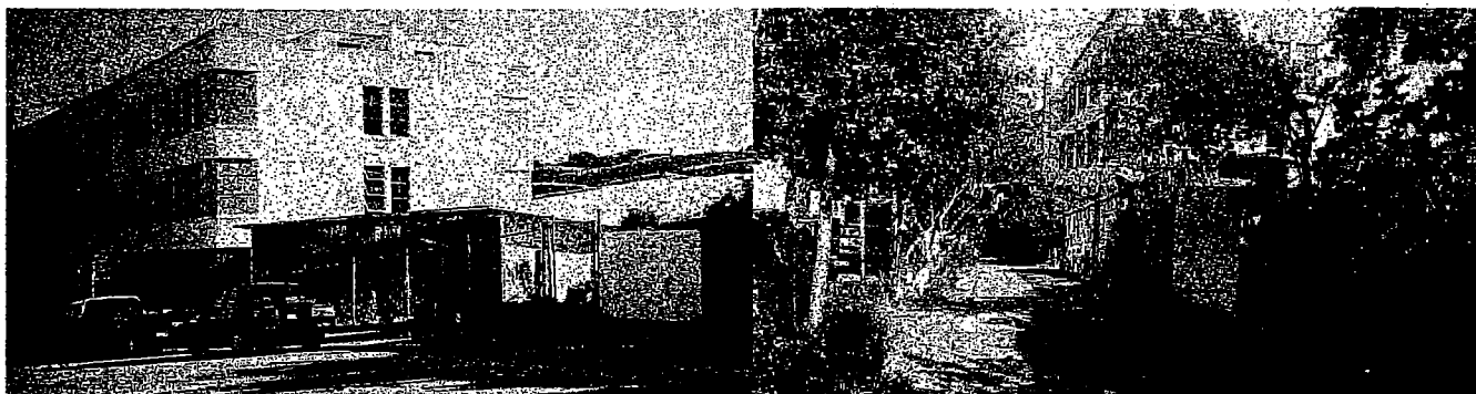
BEFORE: NOVEMBER, 1999 —Barren, sterile Streetscape at OMI/ Excelsior Living Library & Think Park in front of James Denman Middle School and behind San Miguel Child Development Center, San Francisco, CA AFTER: MAY, 2006 - Same Streetscape becomes a California Native Uplands Learning Zone planted with drought tolerant native trees and understory, integrated with children's artworks at OMI/ Excelsior Living Library & Think Park in front of James Denman Middle School and behind San Miguel Child Development Center, San Francisco, CA

By discovering and celebrating our local resources, and experiencing the diversity and commonalities through participation in a global network of Branch Living Libraries , we will be closer to creating and sustaining world peace and prosperity for all species on Earth. And, locally, we will be creating healthy, sustainable communities, integrated with life-long learning for all.