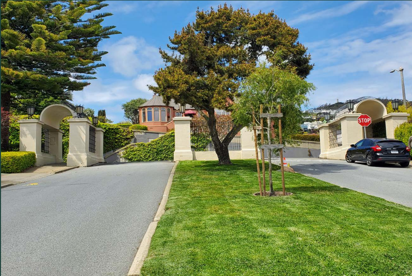
View of Westwood Park Entrance Gates, looking North on Miramar Avenue toward Monterey Blvd