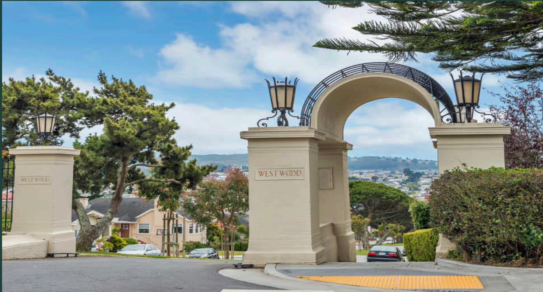
Close up view of Entrance Gates on Miramar Avenue & Monterey Boulevard