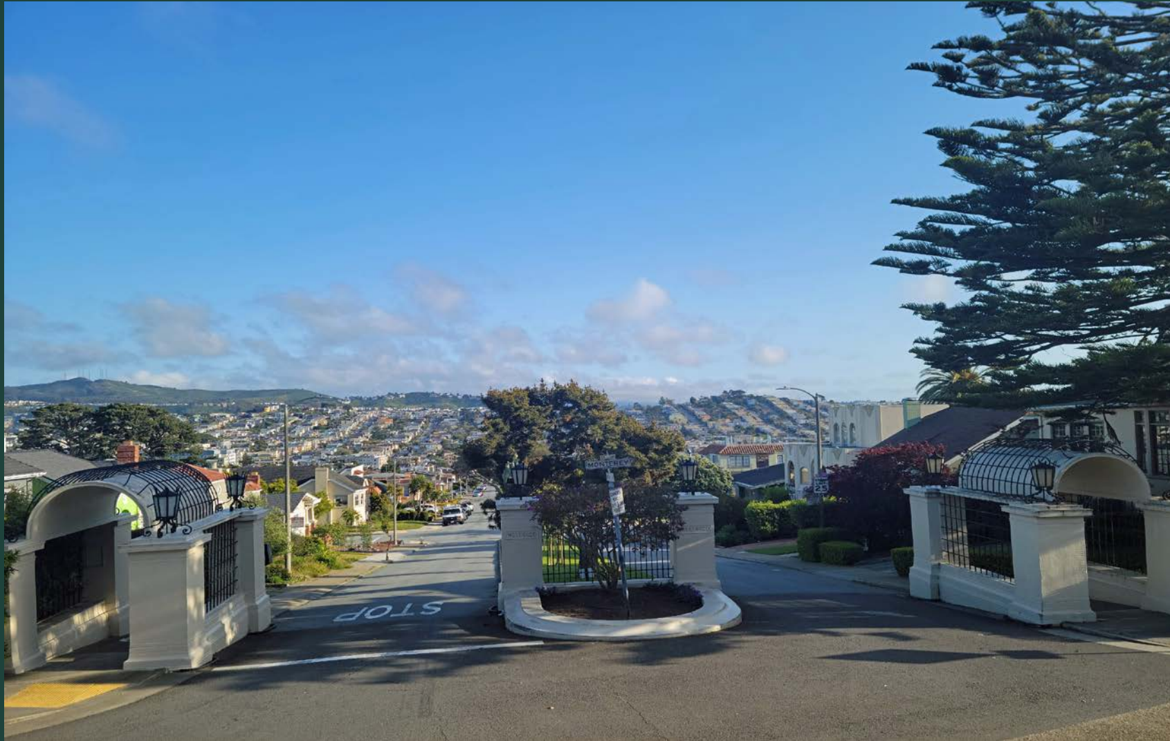
Westwood Park Entrance Gates, looking South on Miramar Avenue from Monterey Boulevard