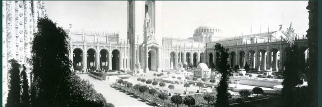
Court of the Ages, 1915 Panama Pacific International Exposition

Renowned architect Louis Christian Mullgardt designed the Westwood Park Entrance Gates, 1915-16