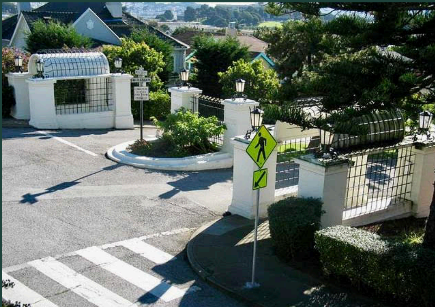
Pedestrian crossing at Westwood Park Entrance Gates, located at Miramar Avenue & Monterey Boulevard