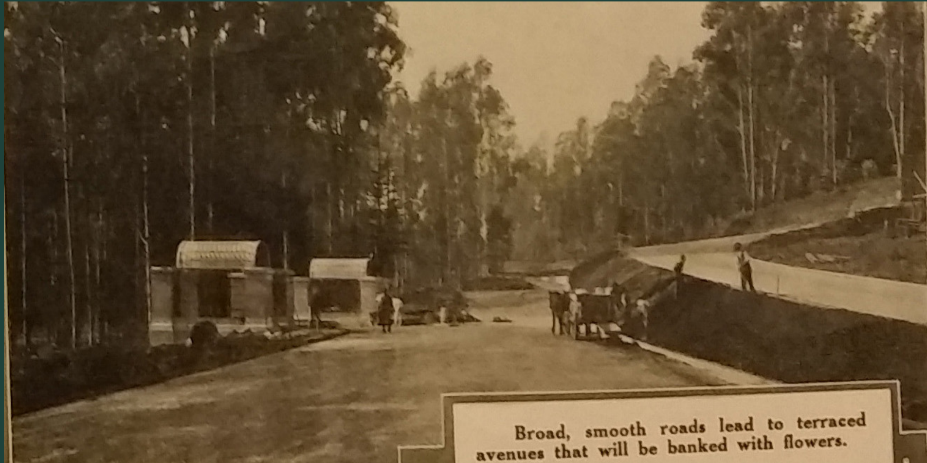
Construction photo in Sutro Forest, of Miramar Avenue & Monterey Boulevard Entrance Gates - from a 1916 neighborhood brochure