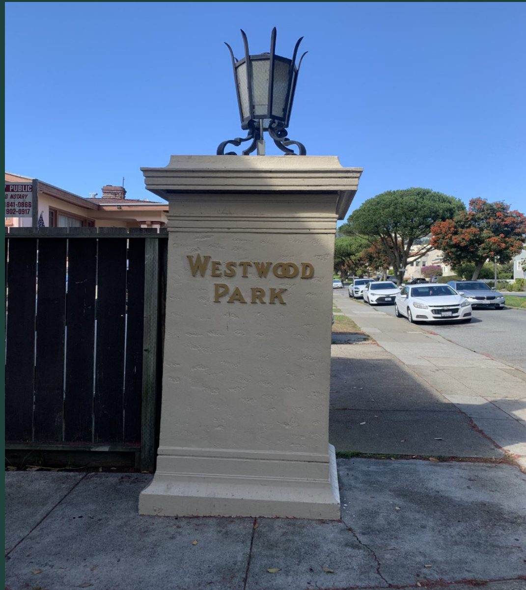
One of four surviving, freestanding Westwood Park pillars