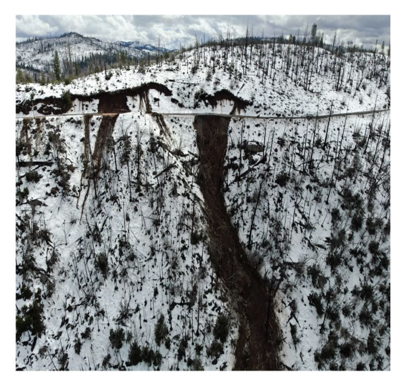
Attachment A Hetch Hetchy Road Failure – Stanislaus National Forest