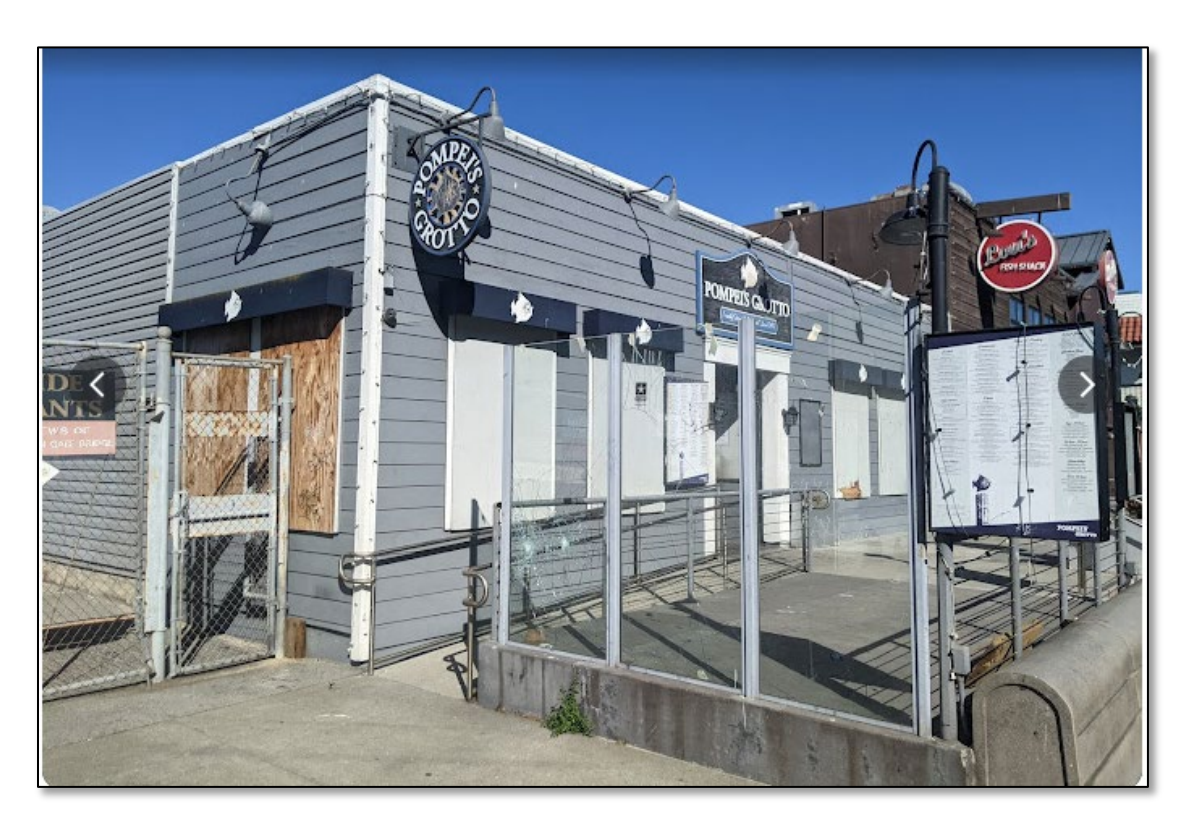
Exhibit 1: Site Location and Photo