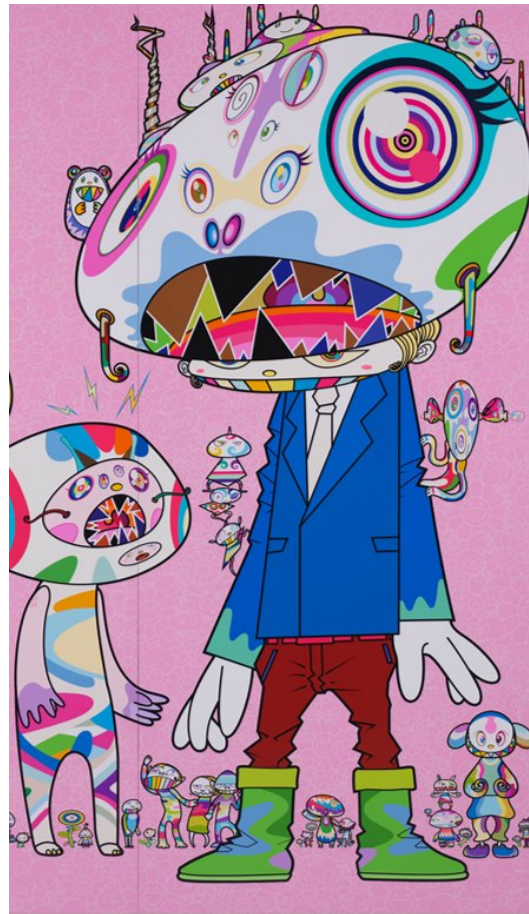
Takashi Murakami Unfamiliar People Sept 15, 2023 – Feb 12, 2024