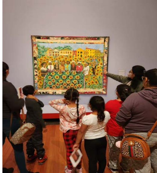
Created a story while viewing the “Quilting bee” at the de Young.