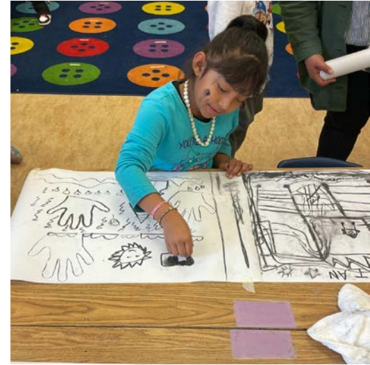
Authoring a story in the classroom.

de Young \ \ Legion of Honor fine arts museums of san francisco