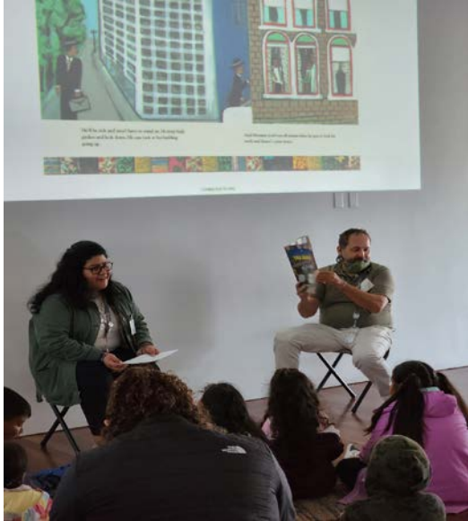
Bilingual Reading of Tar Beach