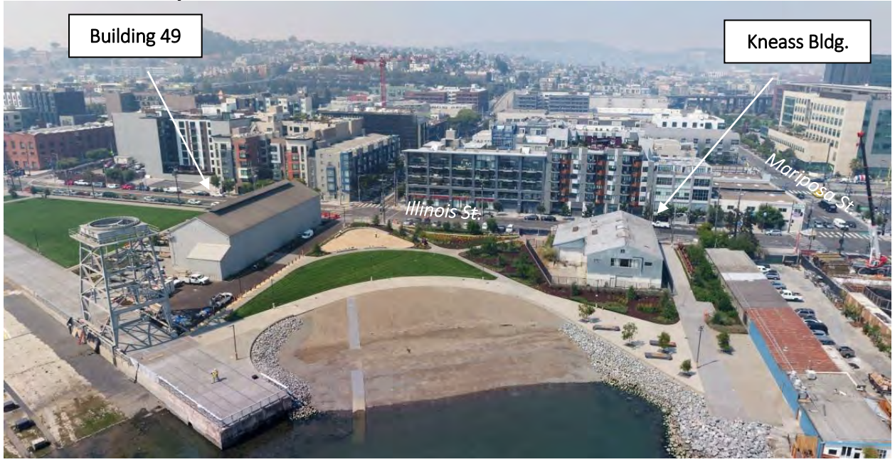
Exhibit 1: Site Map