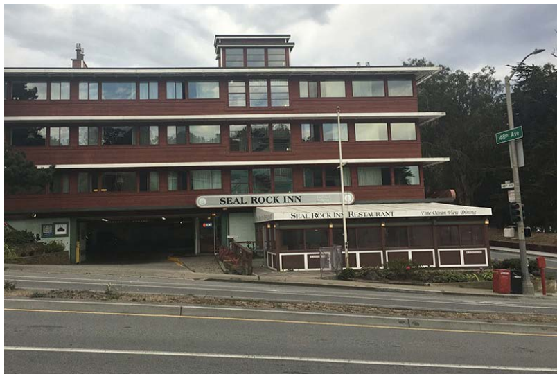
After 46 Years the Seal Rock Inn Restaurant closed August 2020.