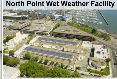
Avg. Dry Weather Flow: 0mgd Wet Weather Cap.: 150mgd