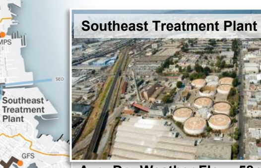
Avg. Dry Weather Flow: 58mgd Wet Weather Cap.: 250mgd