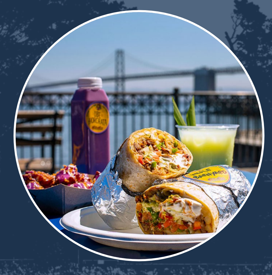
RESTAURANTS, BARS & VENDORS