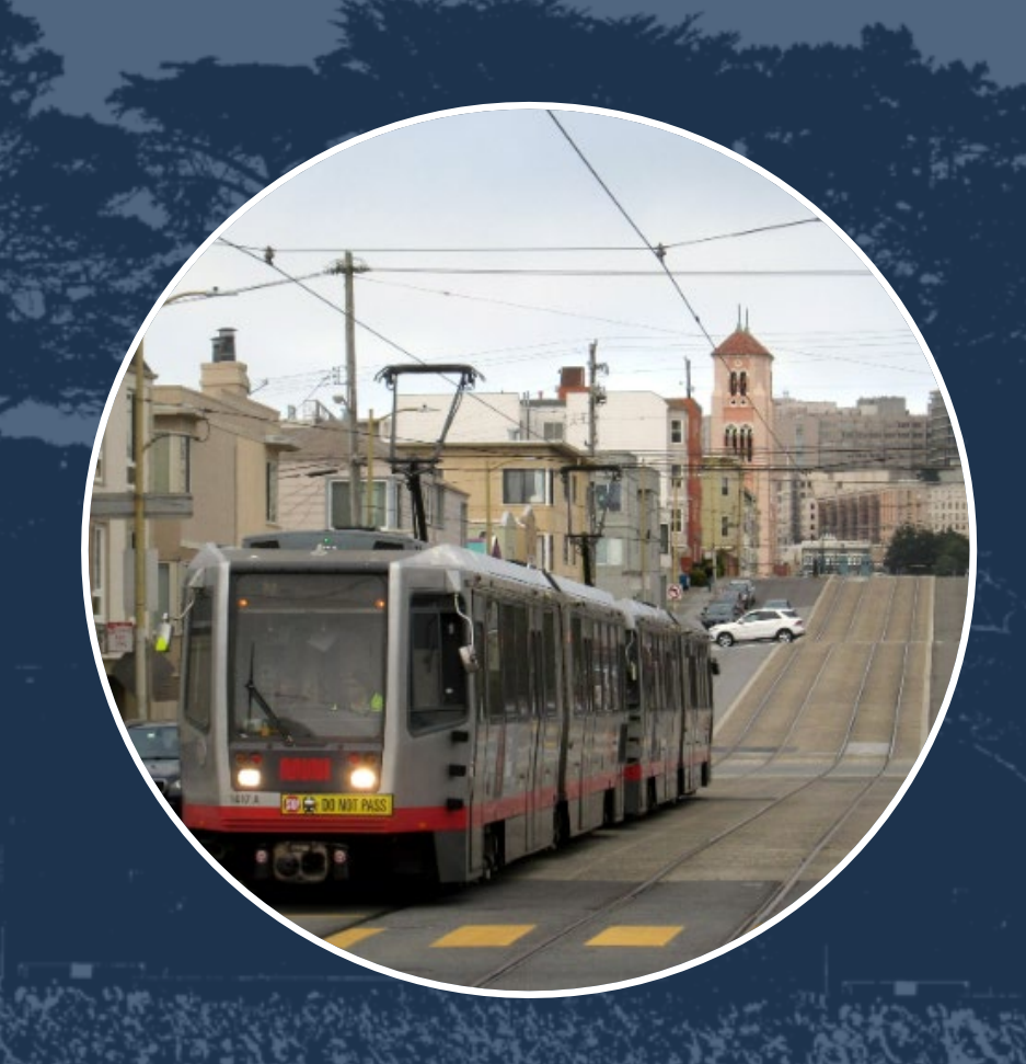
FREE MUNI FOR CONCERT GOERS