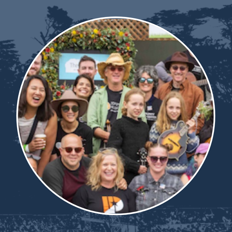
COMMUNITY BENEFIT FUND