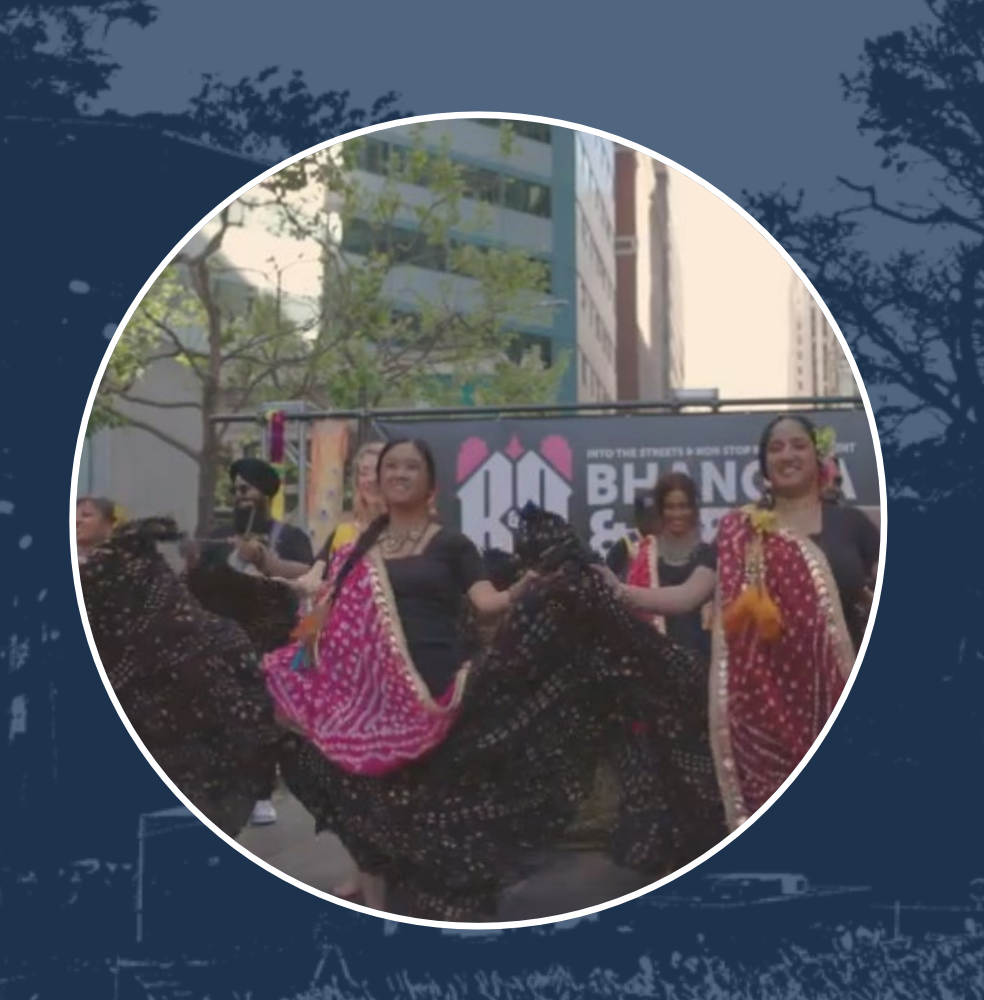
FREE DOWNTOWN CONCERTS