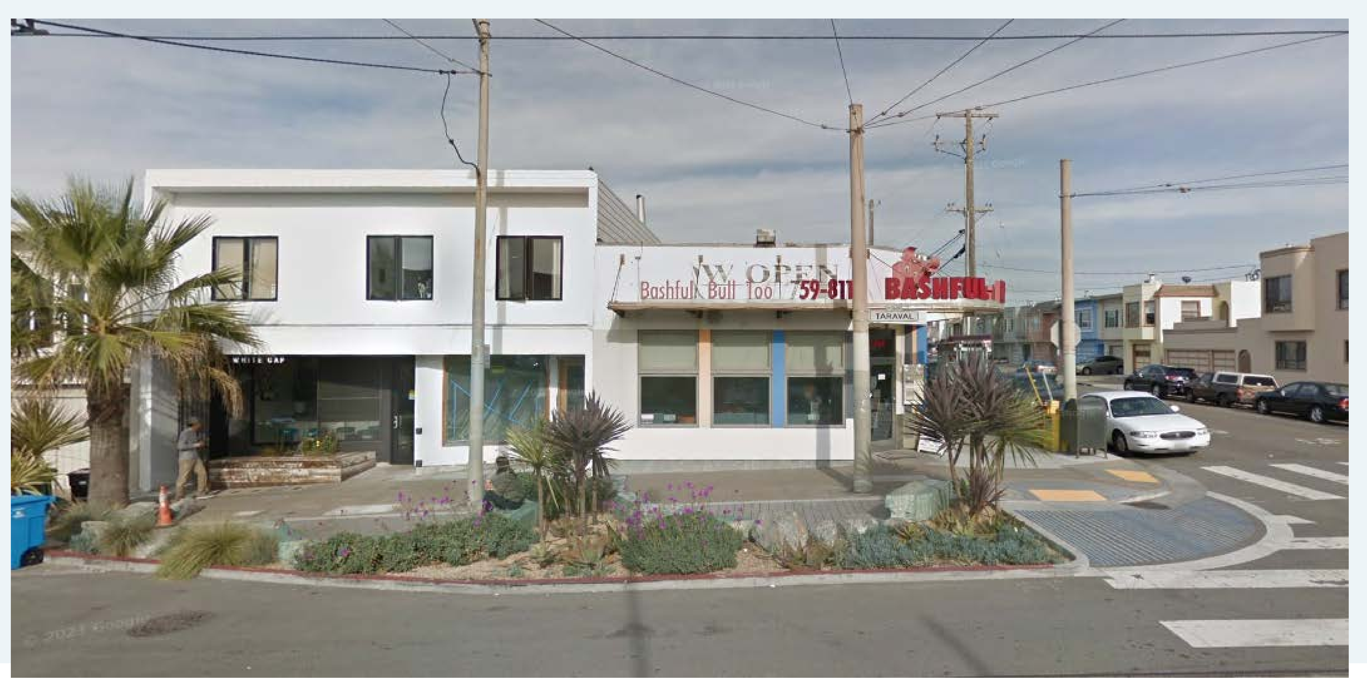
San Francisco Shared Spaces Program | Land Use & Transportation Committee | September 11, 2023