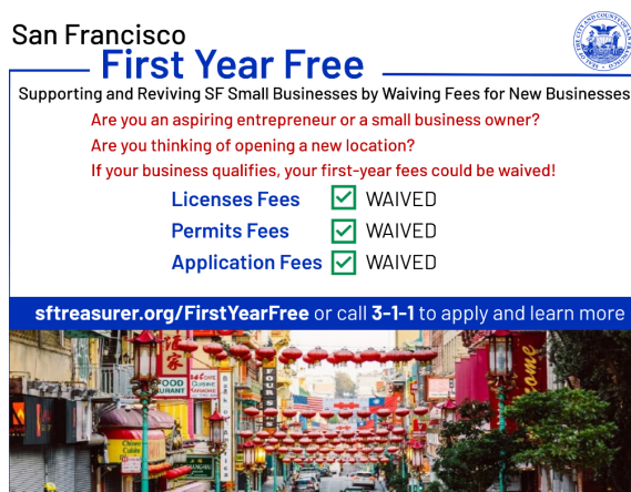
Figure 3: First Year Free Outreach Materials 40