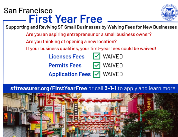
Figure 3: First Year Free Outreach Materials 40