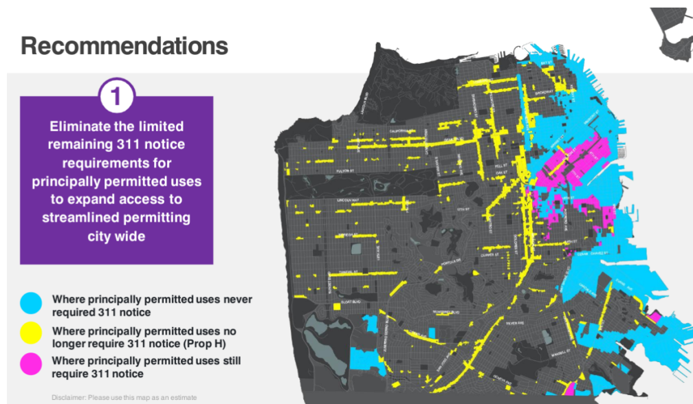
Figure 4: Map Showing 2023 Expansion 62

The Board of Supervisors passed these provisions on April 25, 2023 as part of a package of other zoning changes, and Mayor Breed approved them on May 3, 2023. 63