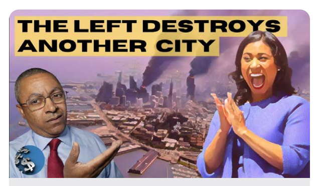
HILTON Hotel Flees San Francisco As CRIME EXPLODES! London Breed's Dying Economy! youtube.com