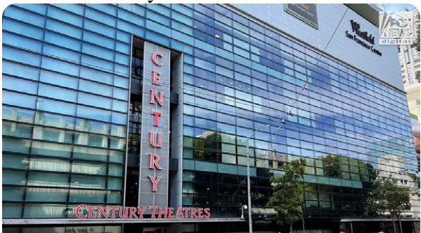
San Francisco loses another large downtown business as city's troubles mount foxbusiness.com

SF will soon be a barren land with homeless, druggies, crazies, and criminals! Good luck with your jobs at the City Hall. You'll have a whole lot of work cut out for you WITHOUT income! Charity work?