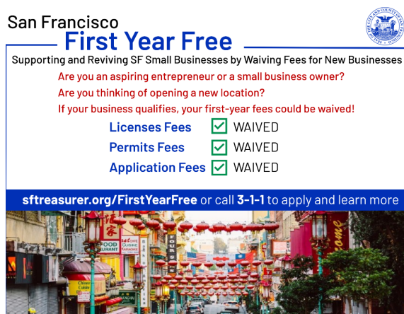
Figure 3: First Year Free Outreach Materials 40