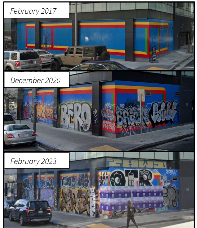
"Wall Drawing #1012" by Sol LeWitt. Installed to fulfill 1% for Art Requirement at 1400 Mission Street, a 100% affordable development.

The Public Art requirement is not just a one-time cost to developers. Over time, artworks require maintenance and possible restoration making them an ongoing operating cost. Further, Section 429 requires the art to be viewable by the public. As a result, most building developers locate their art requirement outdoors where the art is exposed to the weather and vandalism. This only increases the long-term maintenance costs for the building owners or tenants. This can be especially burdensome to 100% Affordable Housing Projects. Ongoing maintenance costs can significantly increase HOA fees for cash-strapped residents. Money spent on repairing or maintaining an art piece also takes away resources that could otherwise be used to fund on-site supportive services. Further, affordable housing projects receiving public funding are also subject to unique governmental constraints including funding subject to specific reporting requirements, prevailing wage expectations, and multi-jurisdictional complexities. All these costs compound the burden of maintaining a six-to-seven figure art piece.