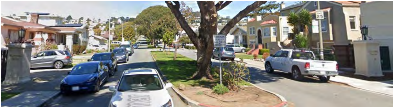
Westwood Park Entrance Pillars at Miramar Avenue and Ocean Avenue, view north, 2023.