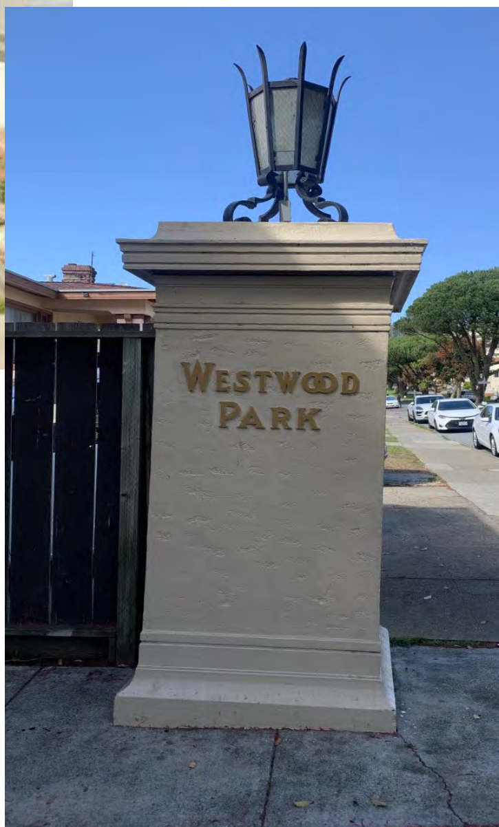
Westwood Park Entrance Pillars, 2023 Above: At Judson Avenue and Frida Kahlo Way Right: At Miramar Avenue and Ocean Avenue