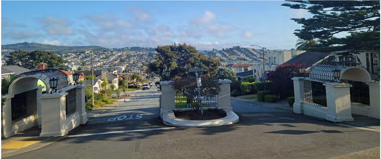
Westwood Park Entrance Gateway, view south, Miramar Avenue and Monterey Boulevard, 2022