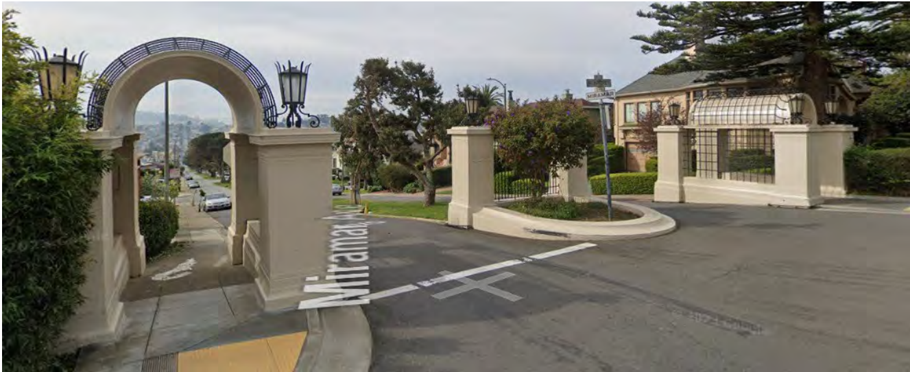
Westwood Park Entrance Gateway at Miramar Avenue and Monterey Boulevard, view south, 2023.