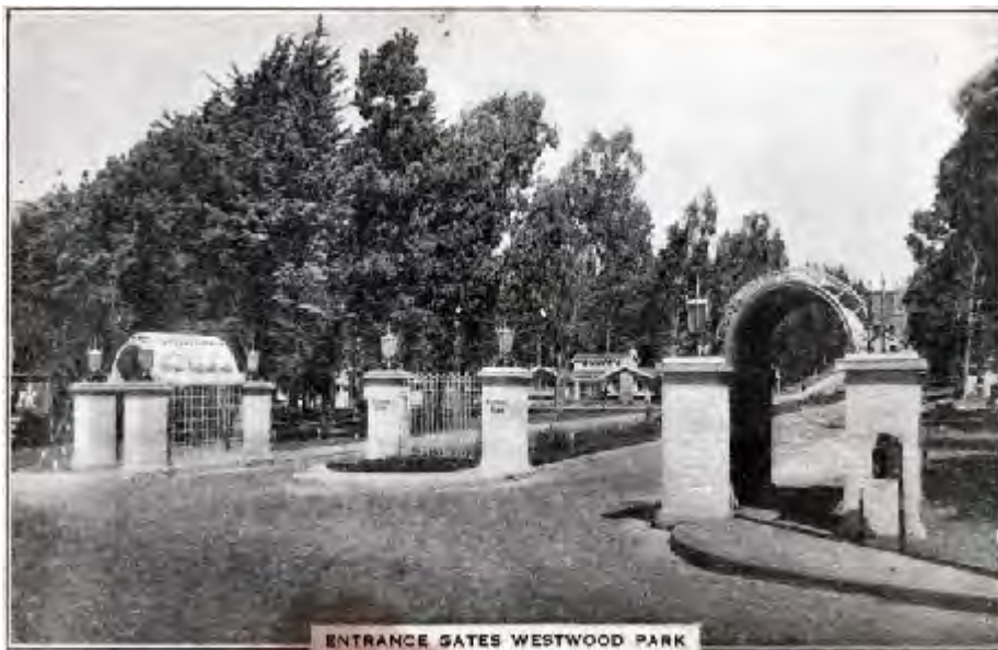
Postcard issued by Baldwin & Howell of Westwood Park Entrance Gateway at Miramar and Ocean Avenues, circa 1916.

[View of Miramar Avenue, looking north from Ocean Avenue in the Westwood Park district]