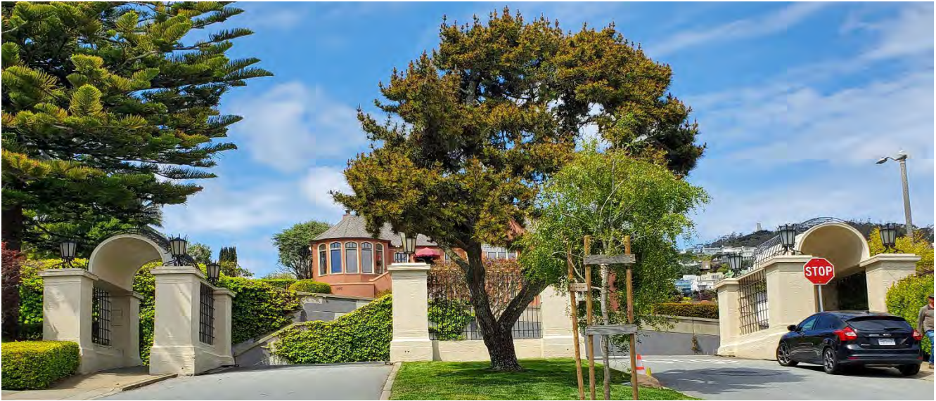
Westwood Park Entrance Gateway at Miramar Avenue and Monterey Boulevard, view north, 2022.