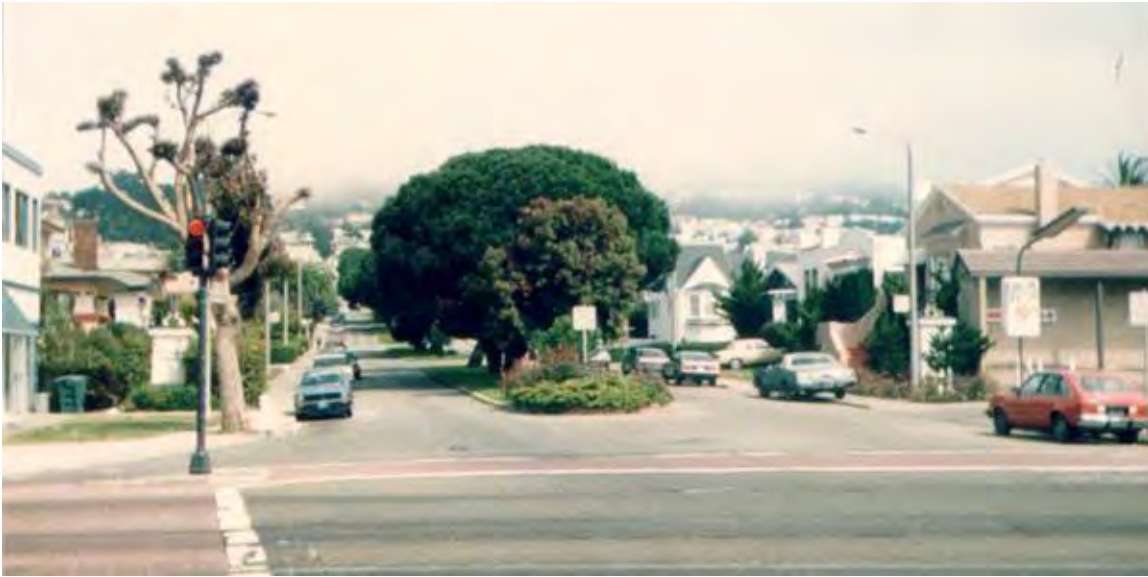
Westwood Park Entrance Pillars at Miramar Avenue and Ocean Avenue, view north, 1980.