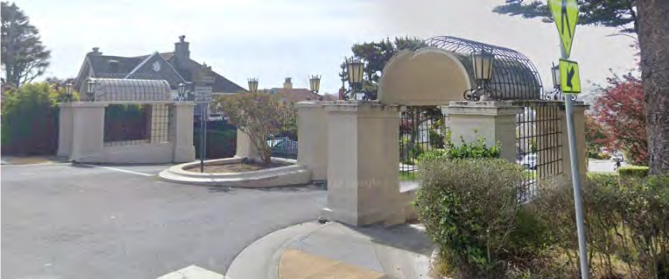
Westwood Park Entrance Gateway at Miramar Avenue and Monterey Boulevard, view southeast, 2022.