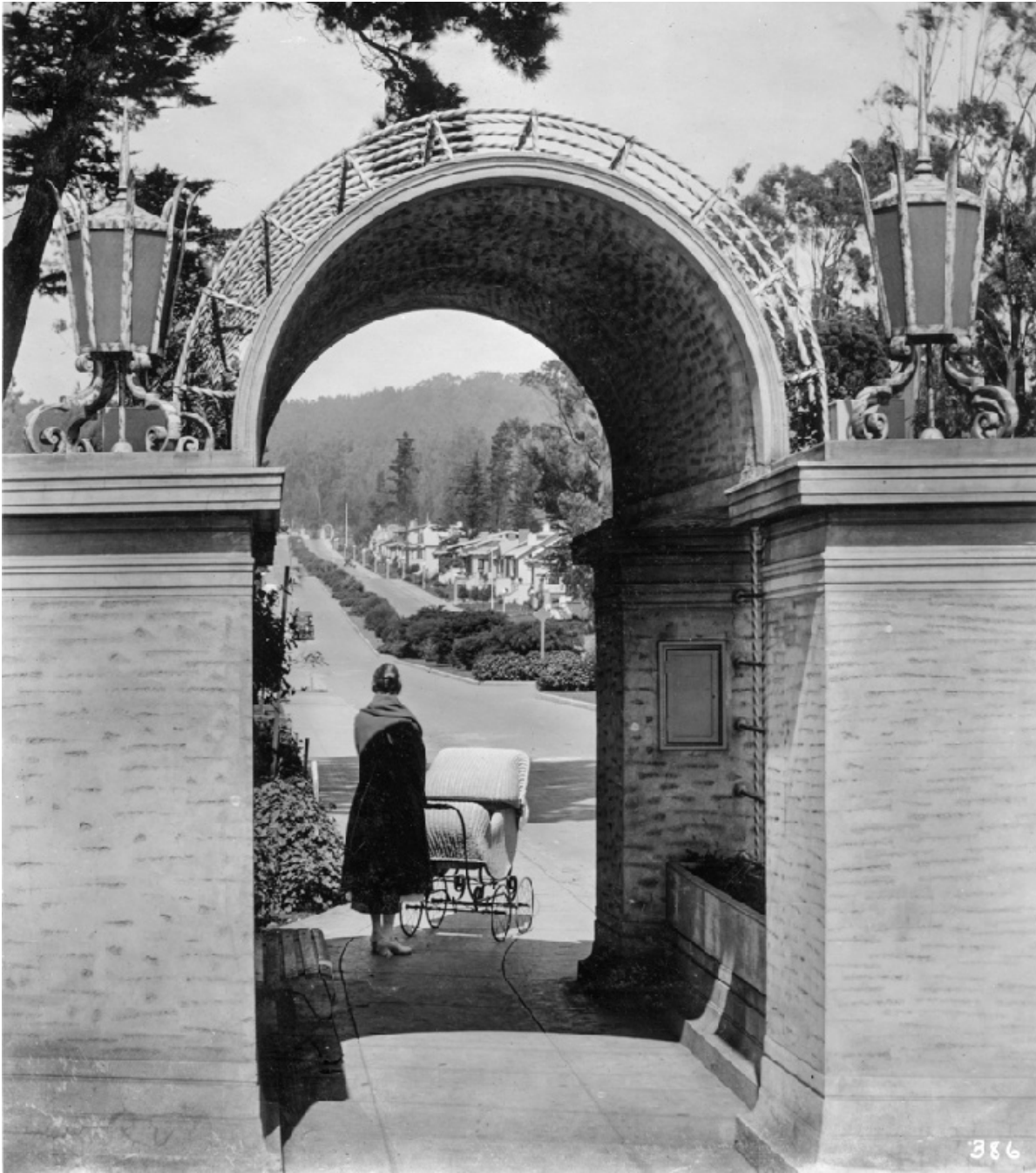
Entrance gateway to Westwood Park on Miramar Avenue, no date.