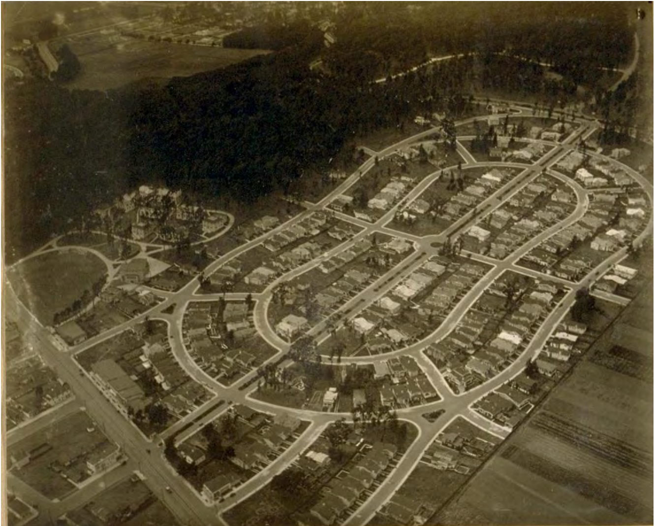
Aerial view of Westwood Park neighborhood, looking northwest (Ocean Avenue at lower left), no date.