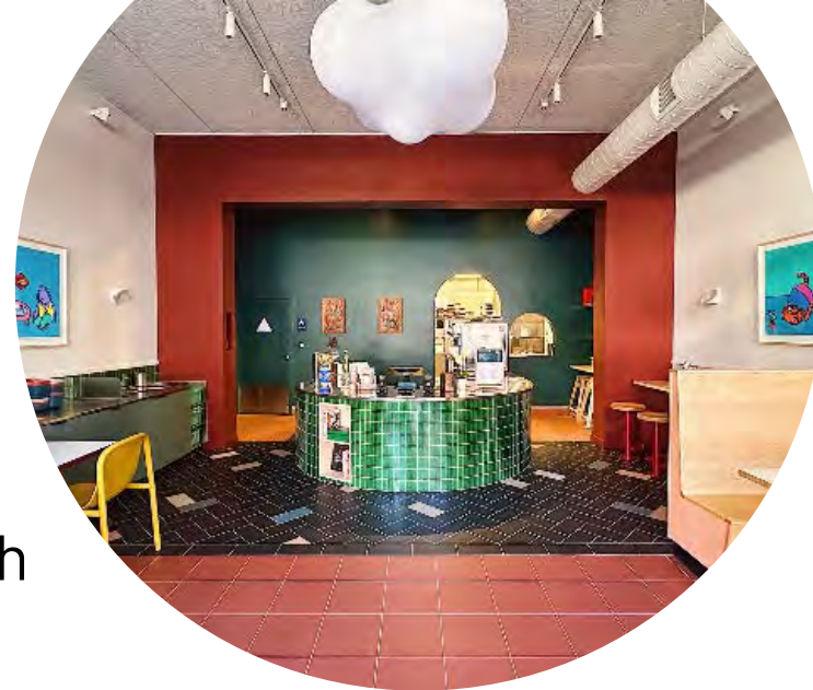
Mamahuhu, 3991 24 St, Noe Valley