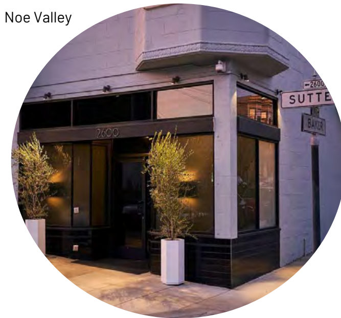
Anomaly, 2600 Sutter St, Lower Pacific Heights