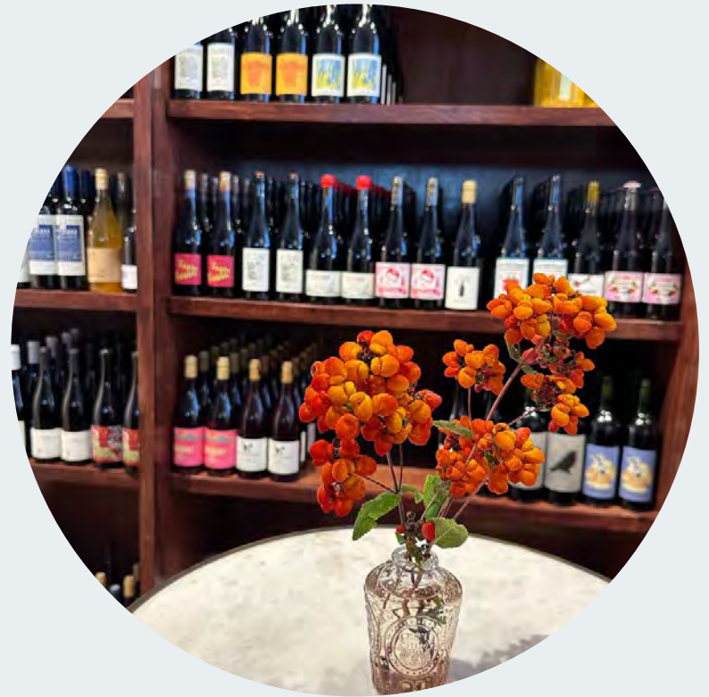
Tala Wine, located at 4625 Mission St in the Excelsior district, opened in May 2023 and benefitted from the First Year Free Program.

“When I first started my online wine club and shop, opening a physical location was a dream, but also a risk. First Year Free saved my business thousands of dollars while we were renovating our space and preparing to open. It helped give me an edge as Tala Wine got up and running.”