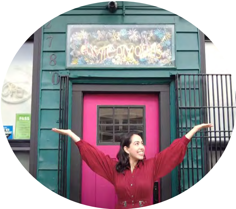
El Mil Amores, located at 2780 21st St. In the Mission District, saved $11,000 in waived fee through the First Year Free Program.