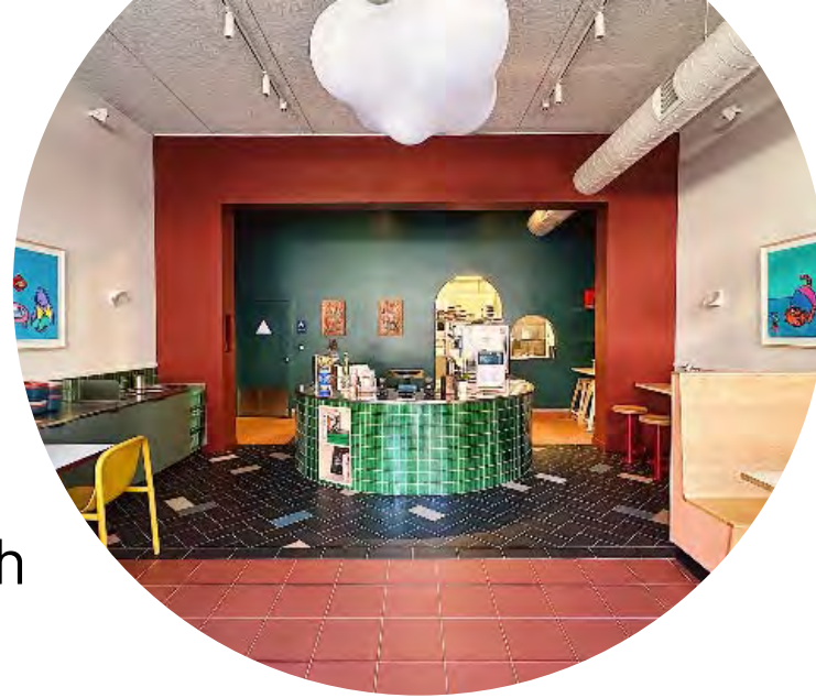
Mamahuhu, 3991 24 St, Noe Valley