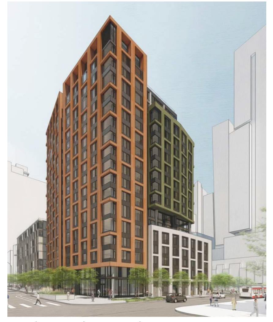
View from Folsom Street at Main Street looking west

Lease-up Completion: Dec. 2026/ Jan. 2027