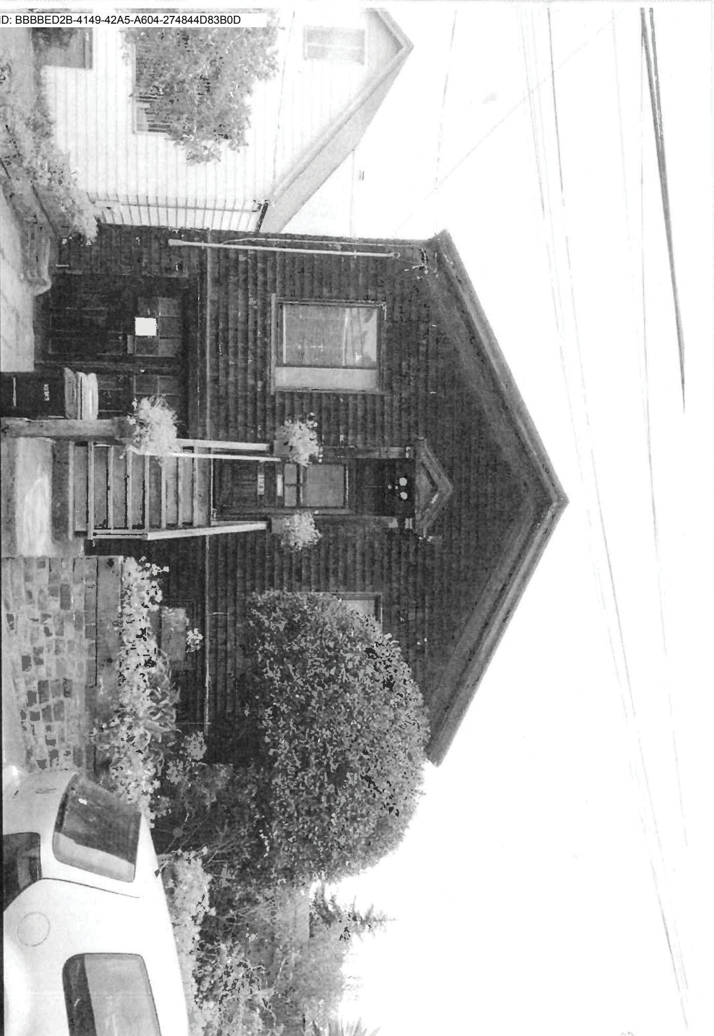
1. SUBJECT PROPERTY, FRONT FACADE, LOOKING EAST