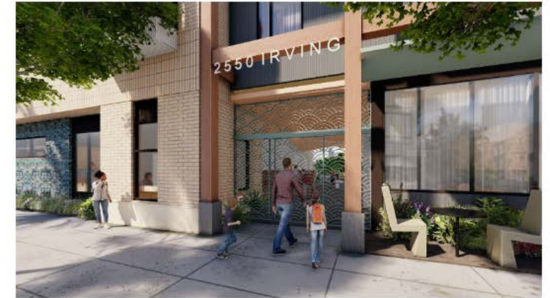
ENTRY PORTAL THROUGH GATE ALONG IRVING