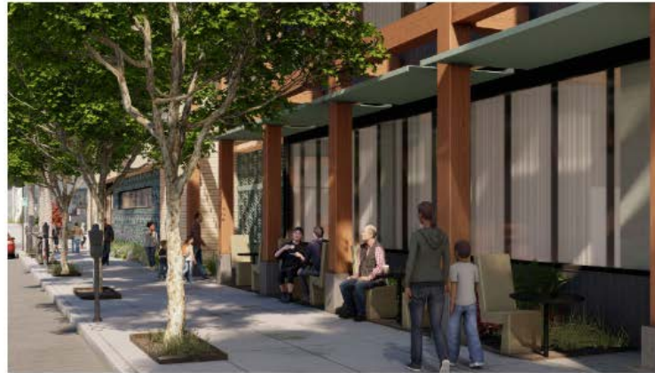
ENTRY PORTAL ALONG IRVING