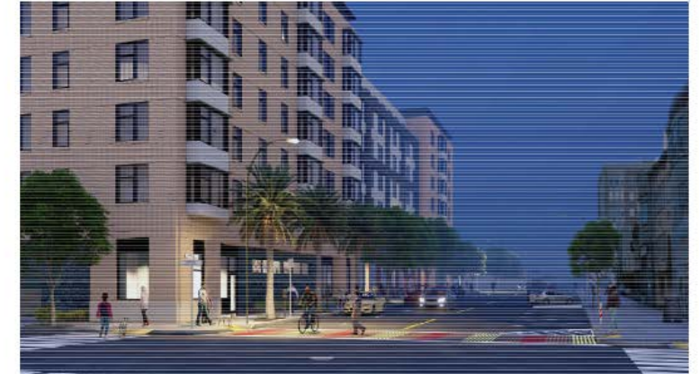
IRVING AND 27TH LOOKING EAST