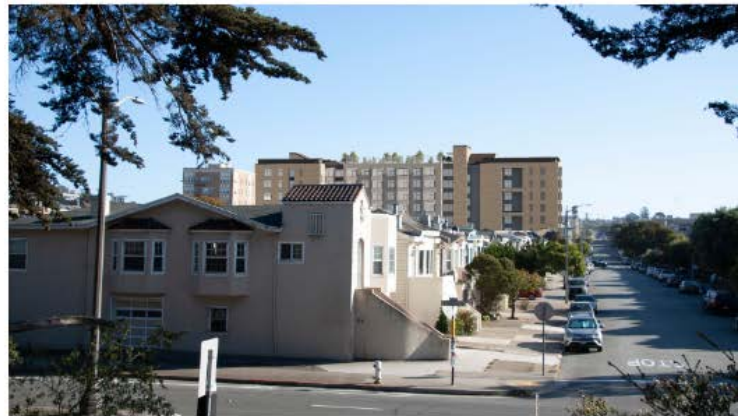
LINCOLN AND 27TH LOOKING SOUTH