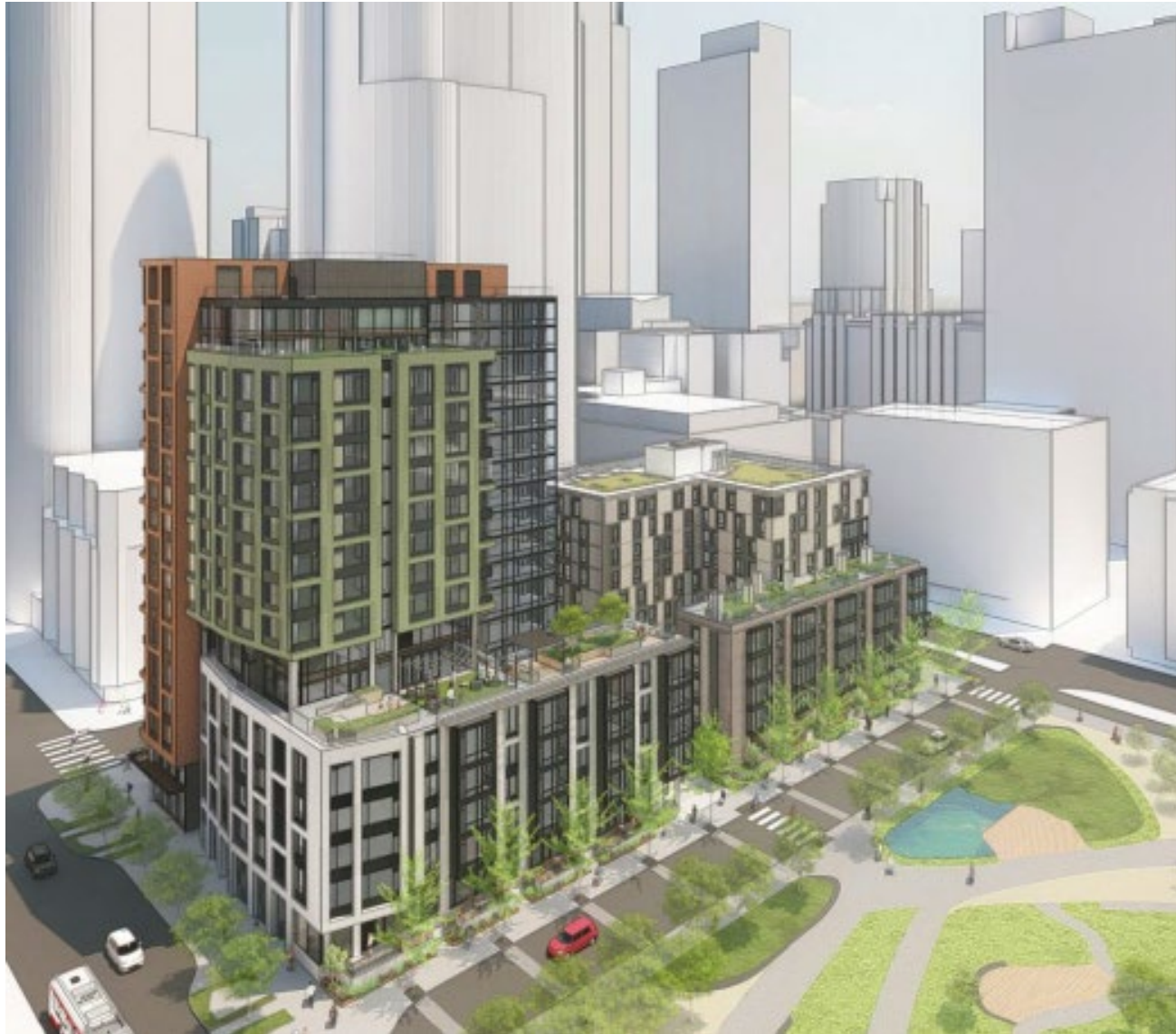
View from Main Street looking south