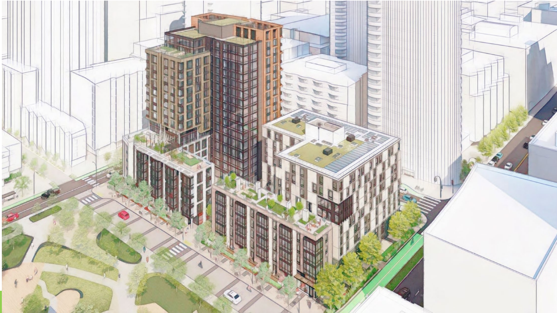
View from Beale Street looking south