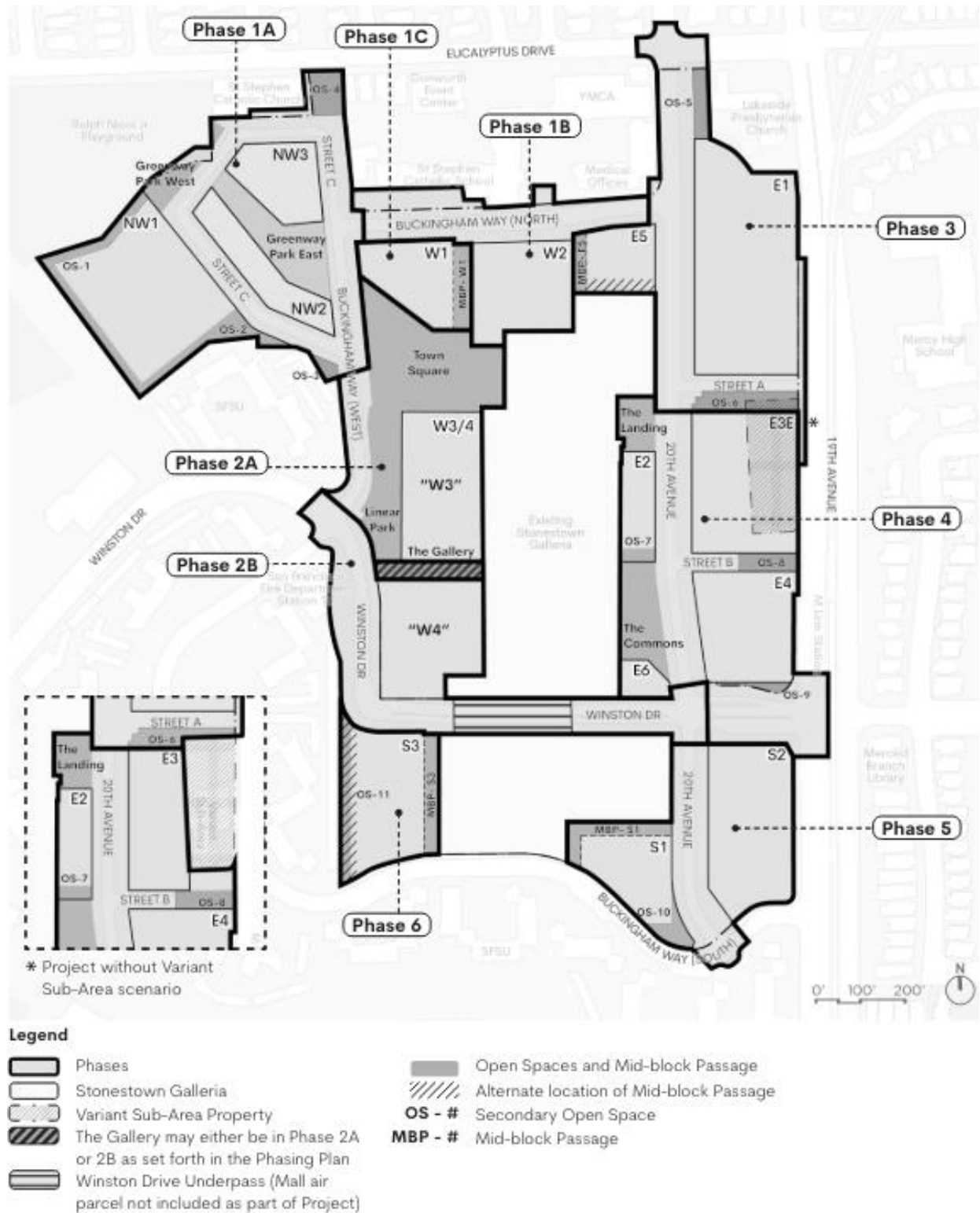
Exhibit 1: Proposed Project Phasing Map