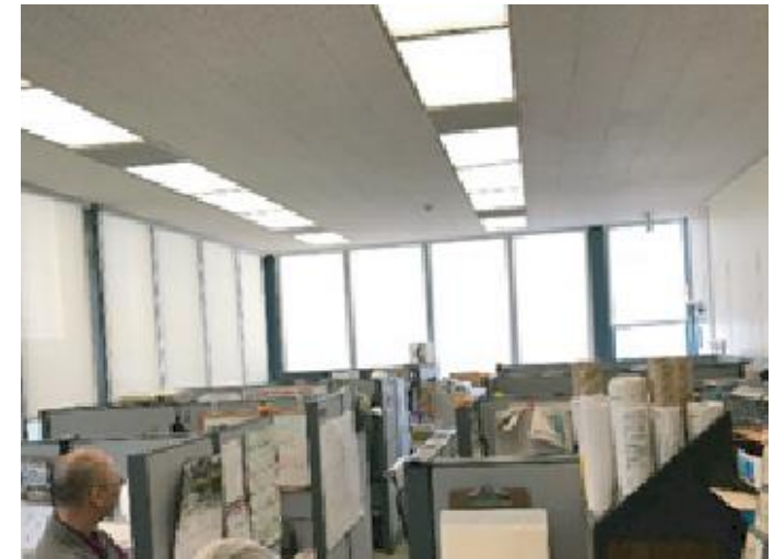
Overcrowded work areas are non-compliant for accessibility and are unsafe.