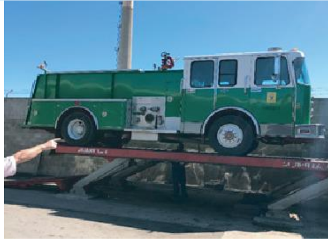
Large vehicles do not fit inside Auto Shop due to door and ceiling heights. Repairs are made outside.