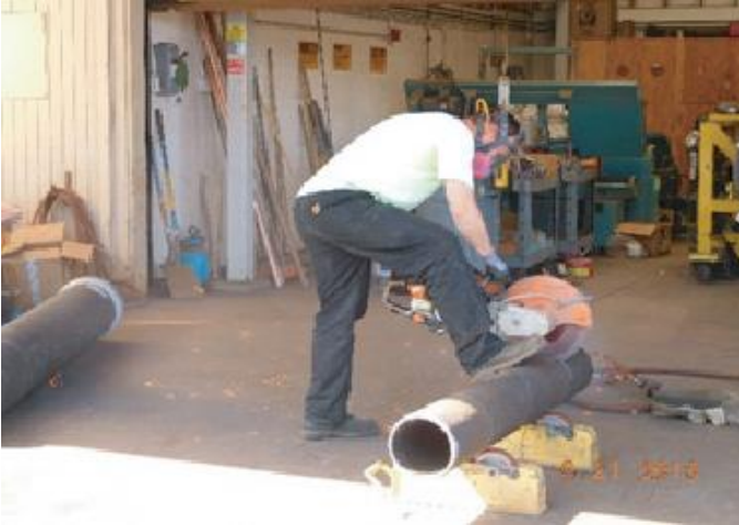
Fabrication Shop workers cut pipe at exterior of shop. Hazardous debris is not contained.