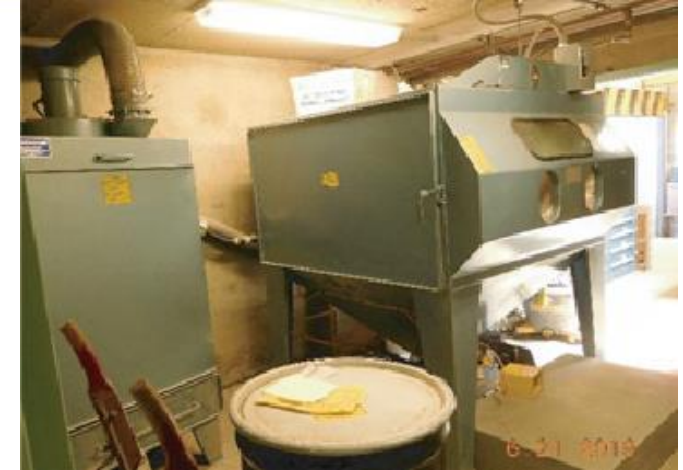
Old B-Blasters in most shops in confined space with inadequate ventilation. No containment of debris.