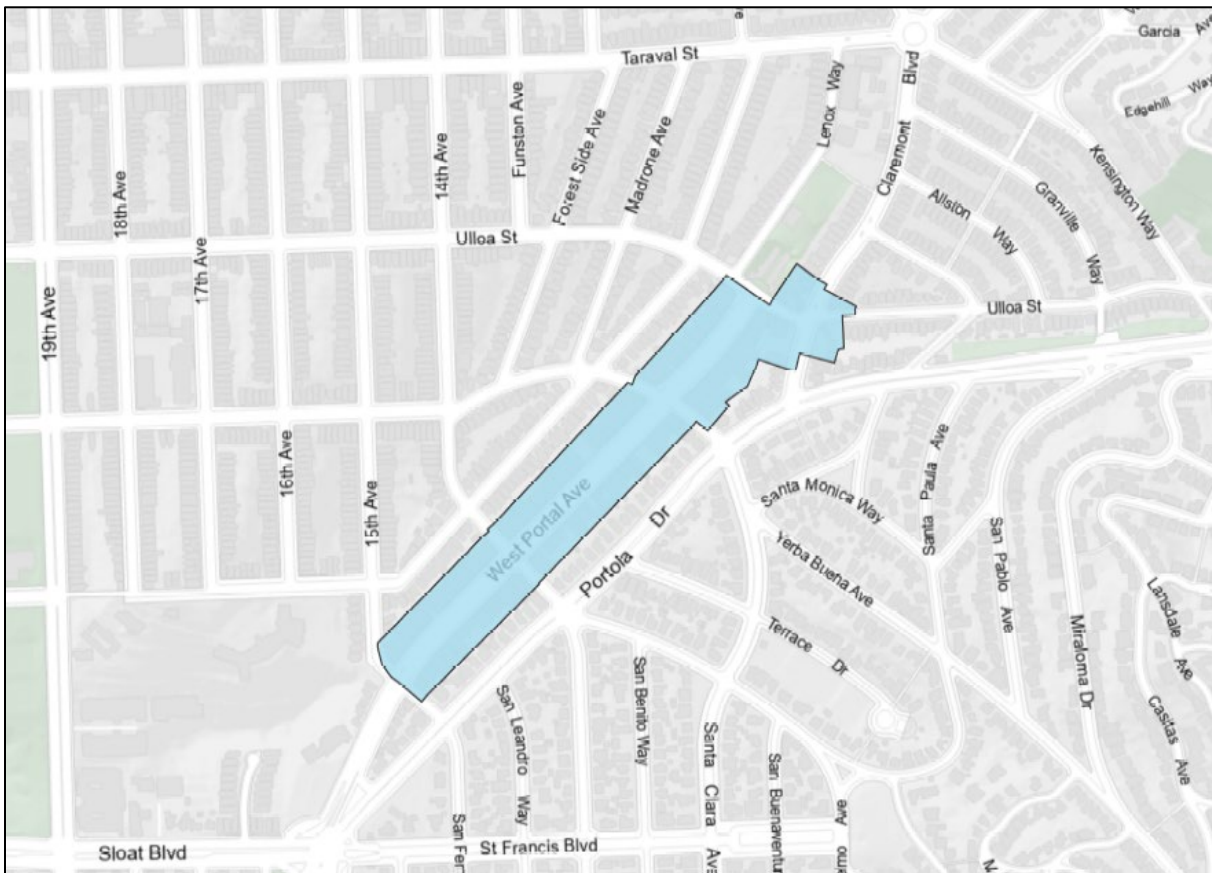
Map of the West Portal Avenue Neighborhood Commercial District.

The West Portal Avenue Neighborhood Commercial District spans three blocks along West Portal Avenue, from Ulloa Street to 15th Avenue, and one block east along Ulloa. West Portal Avenue offers goods and services mainly for residents from nearby single-family neighborhoods. Small-scale retail is frequently broken up by large financial institutions and ground floor medical or professional offices.