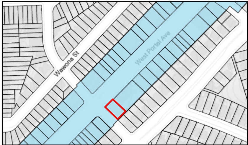
Location of Assessor's Parcel 2989B/017 (red outline) within the West Portal Avenue NCD (blue shaded parcels).

The subject parcel is a one-story, two-unit commercial building. The building previously contained a nail salon and title company. The nail salon's lease expired earlier this year, and the business has relocated to a different location within the NCD. The space formerly occupied by the title company has been vacant since September 2023. In January 2024, a Conditional Use authorization (CUA) application was filed to operate an eye clinic out of both commercial units at the site. At the time, the CUA was required for Health Service uses. The Board subsequently made Health Service uses Principally permitted in the district and the applicant withdrew the CUA application. In September 2024, a building permit was filed to merge the two commercial units into one commercial unit. In October 2024, a building permit was filed to create an ophthalmology clinic that also provides cosmetic services and has a retail component.