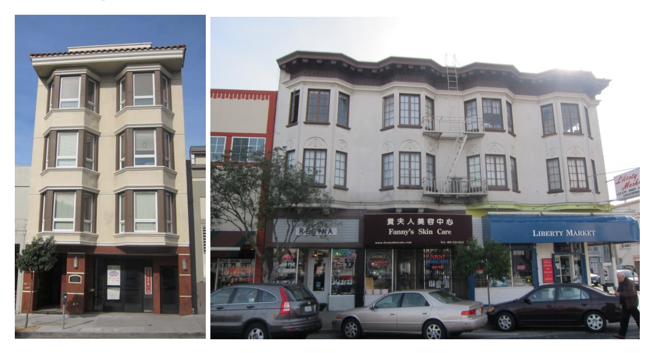
Figure 2-The building on the left is located on Geary Boulevard and 2<sup>nd</sup> Avenue and demonstrates a new development under 40-X including three floors on top of a low ceiling, inactive ground floor. In contrast, the building on the right, located on Geary Boulevard. and 23<sup>rd</sup> Avenue is almost the same height and is able to provide a generously high ceiling and active ground floor.