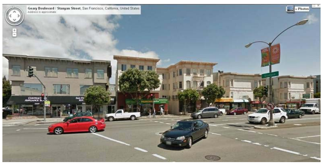
Jordan to Commonwealth, northside of Geary...all 40-X. Behind these lots are the RH-1/RH-2 lots of Jordan Park.