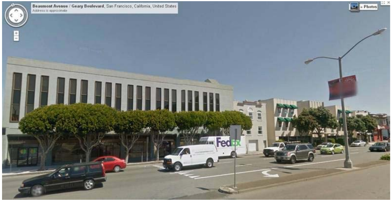
Commonwealth to Parker, northside of Geary...all 40-X. Behind these lots are the RH-1/RH-2 lots of Jordan Park.