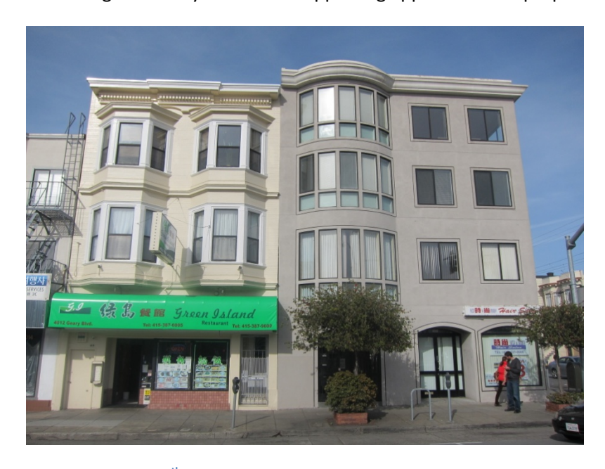
Figure 1- Located on Geary Boulevard and 4<sup>th</sup> Avenue, these two buildings speak to the benefit of proposed Ordinance in enhancing the street frontage of buildings. The building on the right is a newer four story building with an inactive and lower ceiling ground floor. The building on the left, almost equally as tall, only includes three floors but more active and higher ceiling ground floor. An additional maximum five foot for the building on the right, could have improved the ground floor while maintaining the four stories.