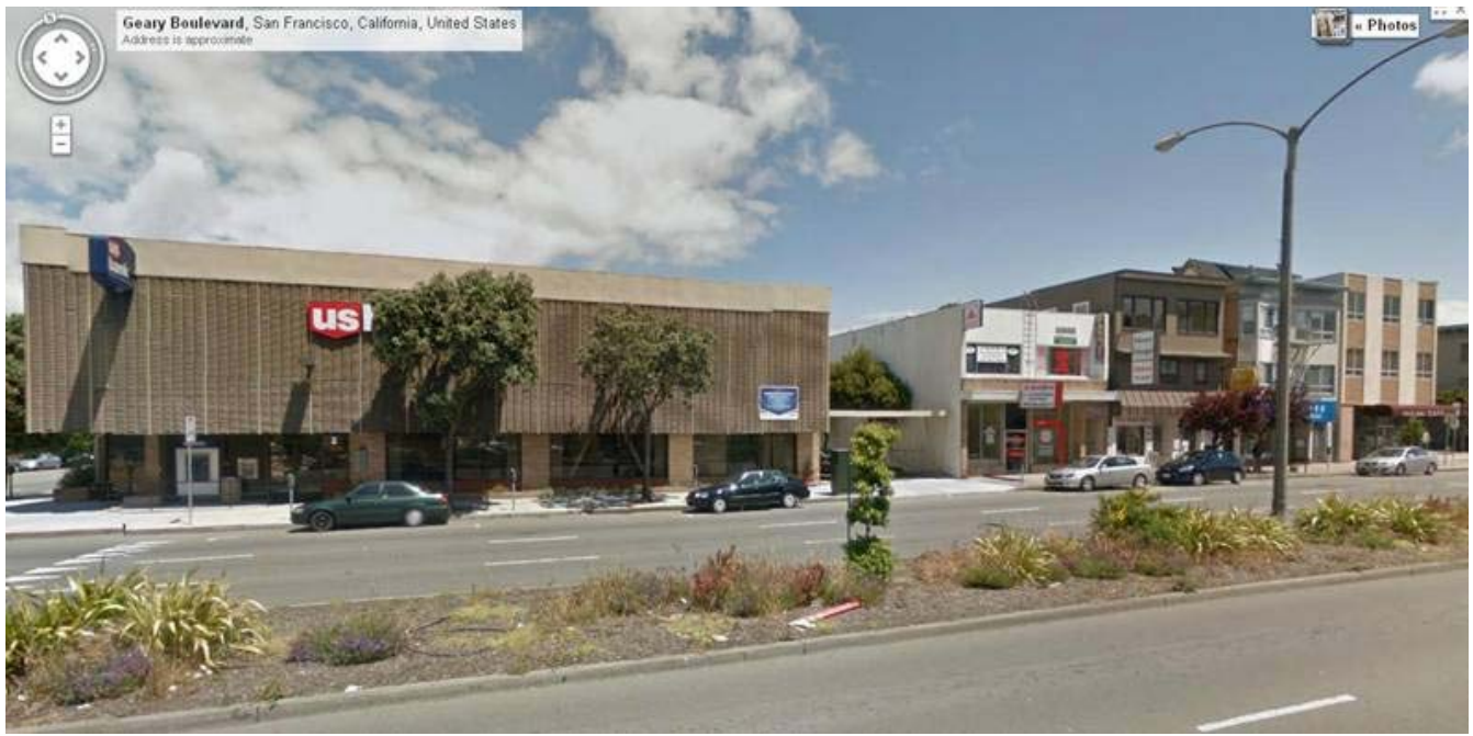
Palm to Jordan, northside of Geary...all 40-X. Behind these lots are the RH-1/RH-2 lots of Jordan Park.

Now look at the existing buildings from Palm to Jordan, Jordan to Commonwealth and Commonwealth to Parker in our Jordan Park Improvement Association area. Note that the buildings are basically only 4 stories tall.