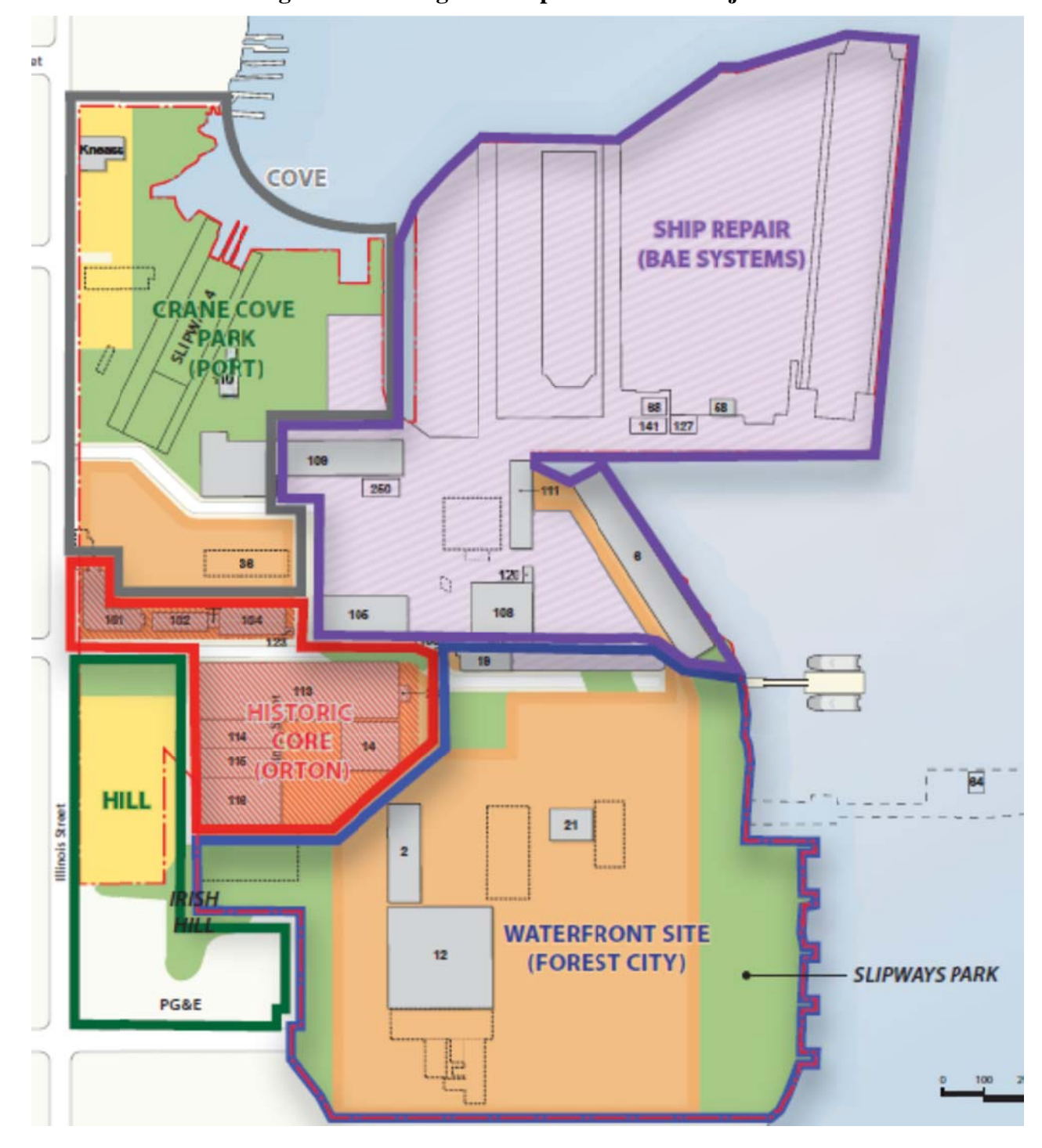
Figure 1: Existing and Proposed Pier 70 Projects