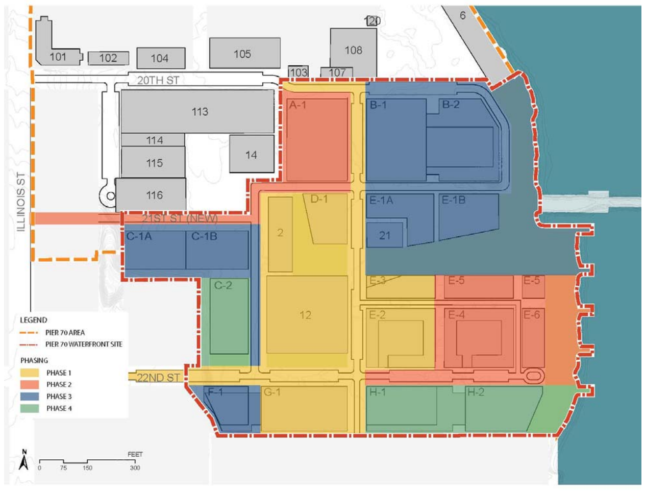
Figure 2: Proposed Waterfront Site Project

constructed buildings (vertical development) and historic rehabilitation of existing industrial buildings (historic improvements) consistent with the Secretary of the Interior's Standards for the Treatment of Historic Properties. The proposed Waterfront Site project is pictured below in Figure 2.