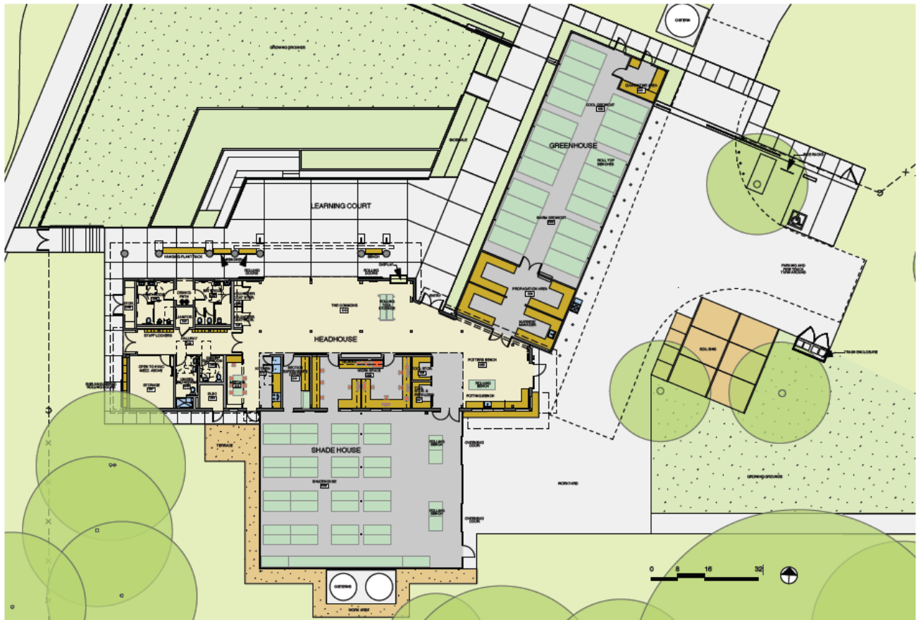
NURSERY: CENTER FOR SUSTAINABLE GARDENING SAN FRANCISCO BOTANICAL GARDEN AT STRYBING ARBORETUM