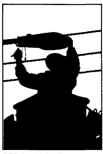
LED Streetlight Installation

facilities over 60 years old, and preparing a retrofit/replacement program that will include specific recommendations, strategies for capital recovery, and an implementation schedule. The plan also includes funding for a portion of the engineering and construction costs associated with the installation of new streetlights as part of the Van Ness Bus Rapid Transit (BRT) Project.