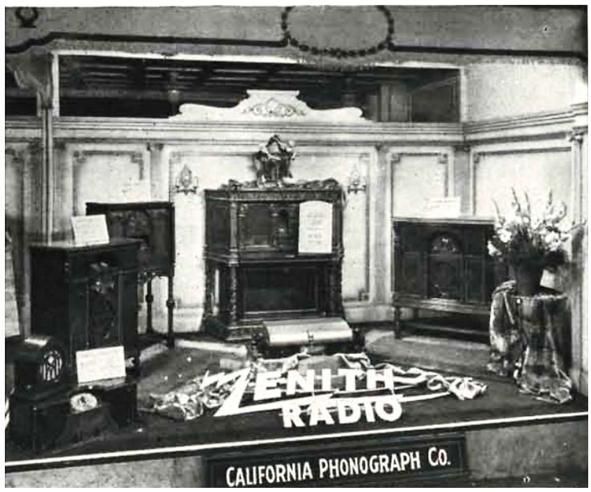
1928 image of a window display for the California Phonograph Company store at 1009 Market Street. ( Presto-Times , The American Music Trade Weekly, Number 2198, (September 15, 1928), p.16.