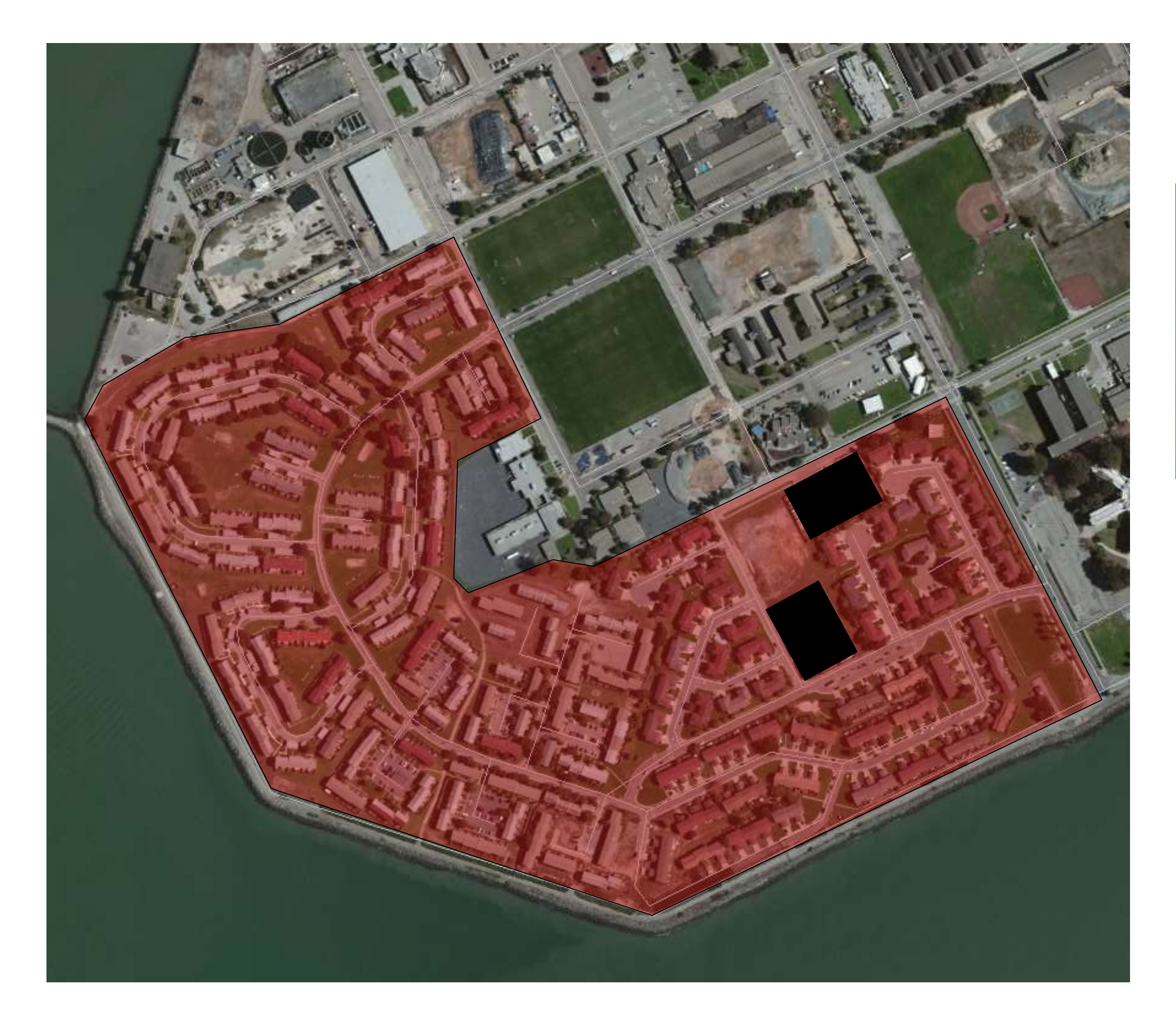
Exhibit B - Map Treasure Island Residential Neighborhood