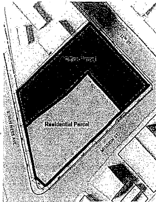
Figure 1: Map of 1500-1580 Mission Street

building on the eastern portion (along 11 th street) which represents approximately 48% of the site. In addition, Related intends to develop an approximate 38 story, 550 multifamily residential unit 2 development on the western portion (along Van Ness Avenue), with ground level retail, which represents approximately 52% of the site.