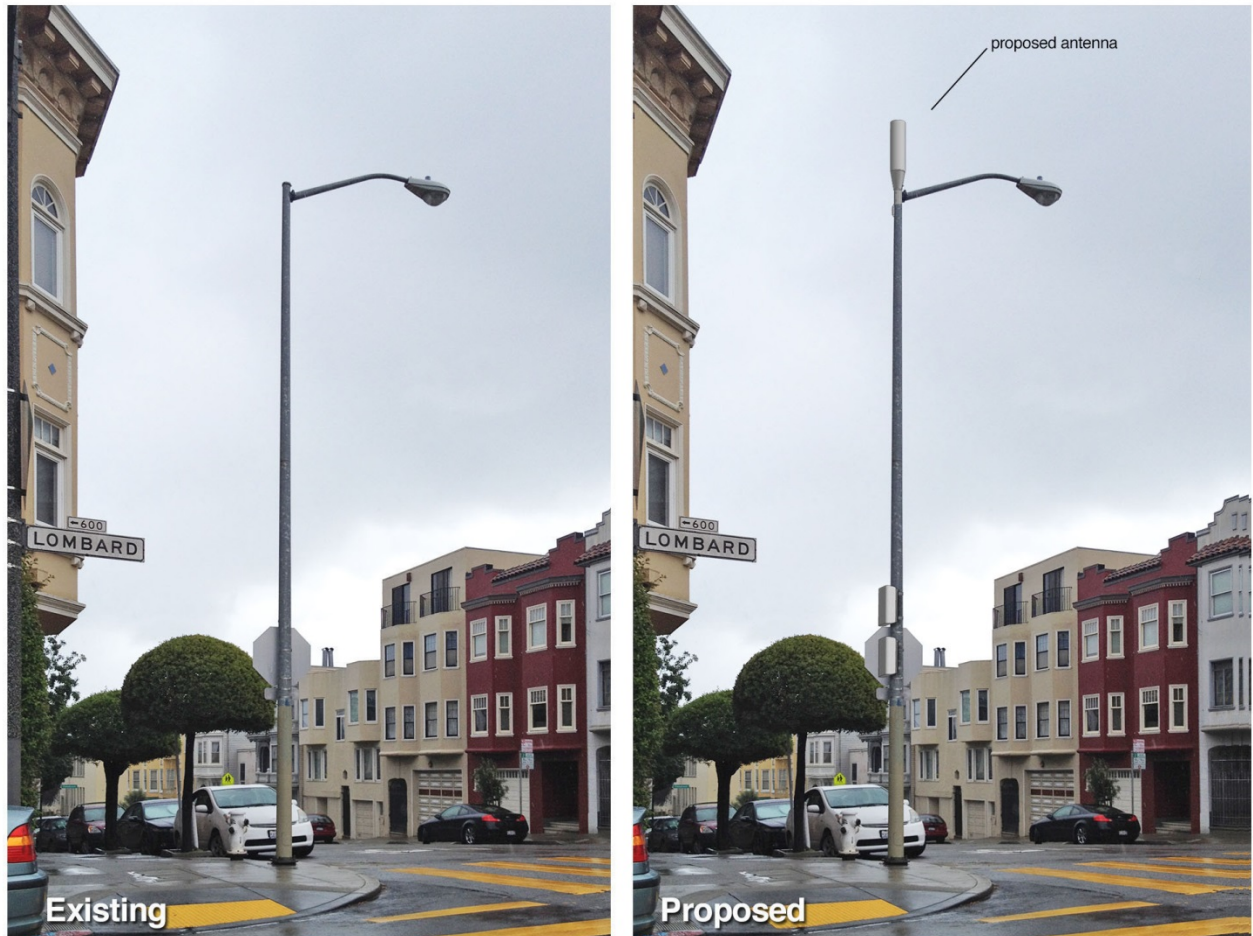
Exhibit: Installation of DAS Equipment on Street Light Pole