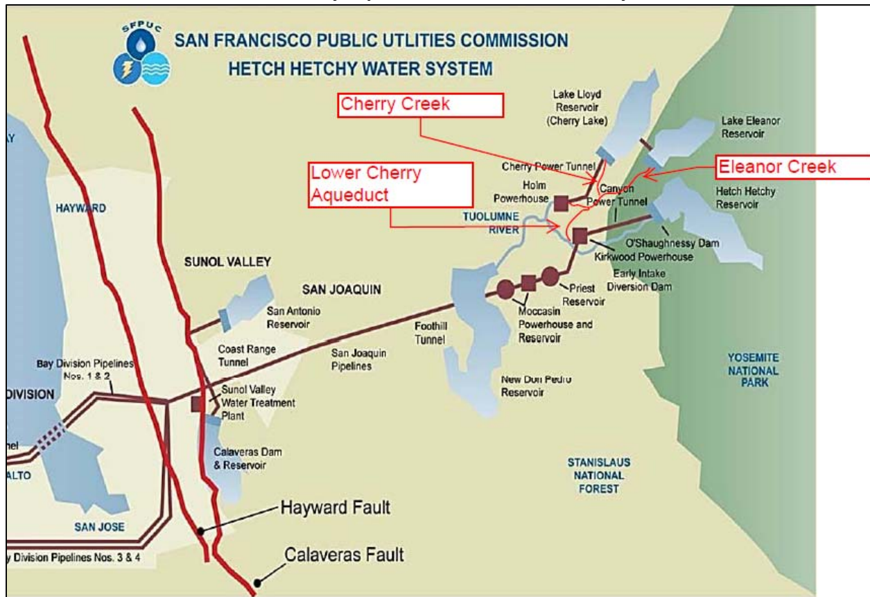
Exhibit 1: The Lower Cherry Aqueduct and the Sunol Valley Treatment Plant