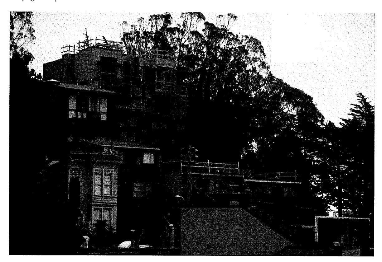
Same house in perspective with red arrow – Fits perfectly in the neighborhood.