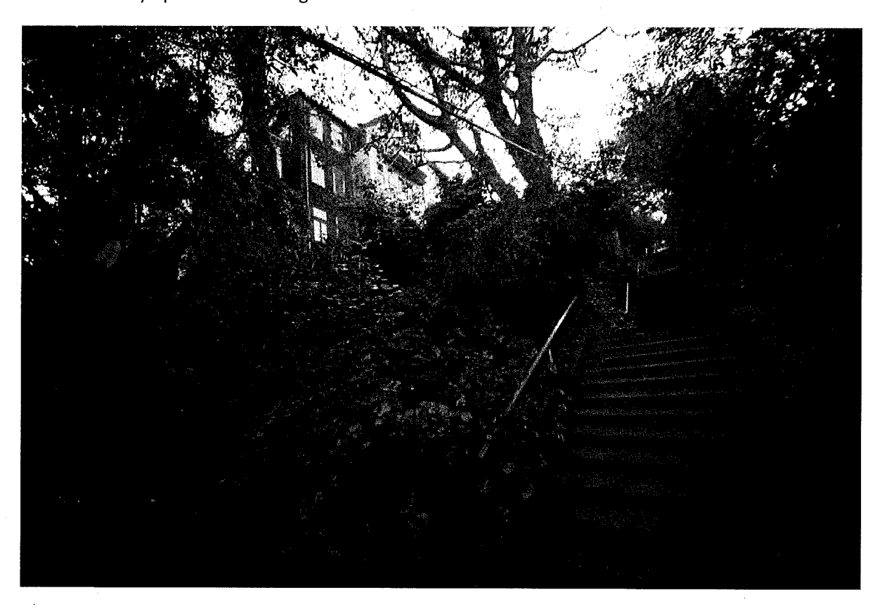
Modern single family home on Vulcan Stairway.