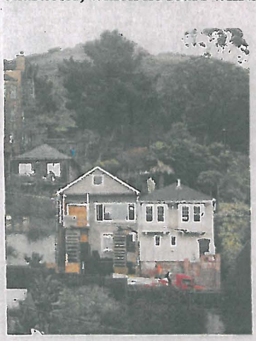
Two modest older homes on States Street in Corona Heights are surrounded by verdant open space.

small cottages in the area would sell for north of $900,000 — neighbors are quick to point out that the housing that has been proposed, over $3 million per home in the current market, is far less affordable than what is there now. In addition, all of the projects in the Ord Court, Ord Street and States Street area are being proposed by developers rather than families planning to live there