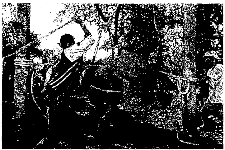
how baby elephants are beaten into submission

you shouldn't rent a baby elephant... ever. The only way to have a "tame" baby elephant is throughout torture. Elephants are naturally wild creatures and belong in the wild where they can be free. I have seen first hand the differences between a free happy baby elephant that can do as it pleases and a baby elephant forced into tourism.