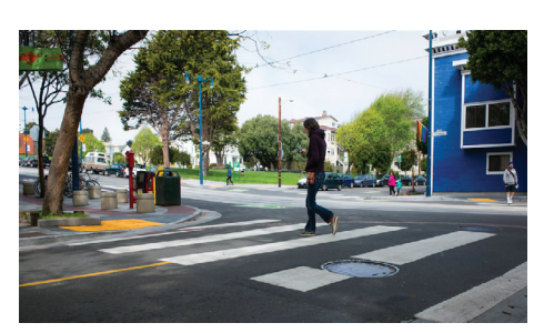
Pedestrian & transit bulb-outs extend the sidewalk into the roadway to provide safer street.