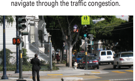
New traffic & pedestrian countdown signals improve visibility of the signals, traffic flow, and safety of the roadway.