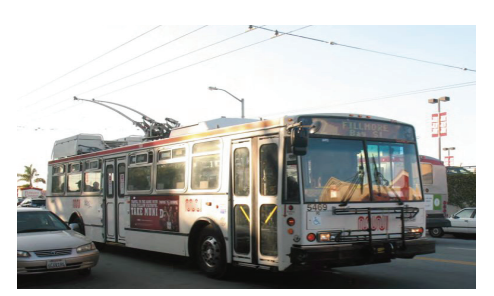
Extension of overhead wire system enables zeroemission transit service to Mission Bay.