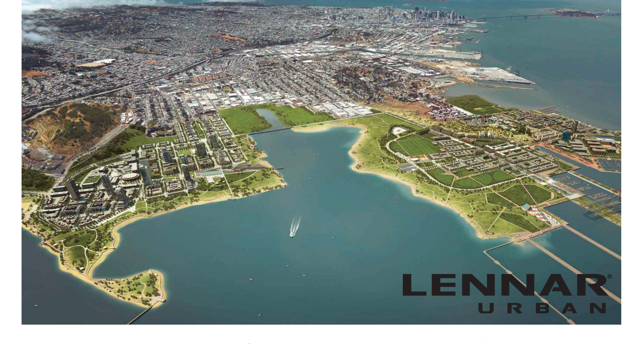
San Francisco Board of Supervisors – Land Use Subcommittee