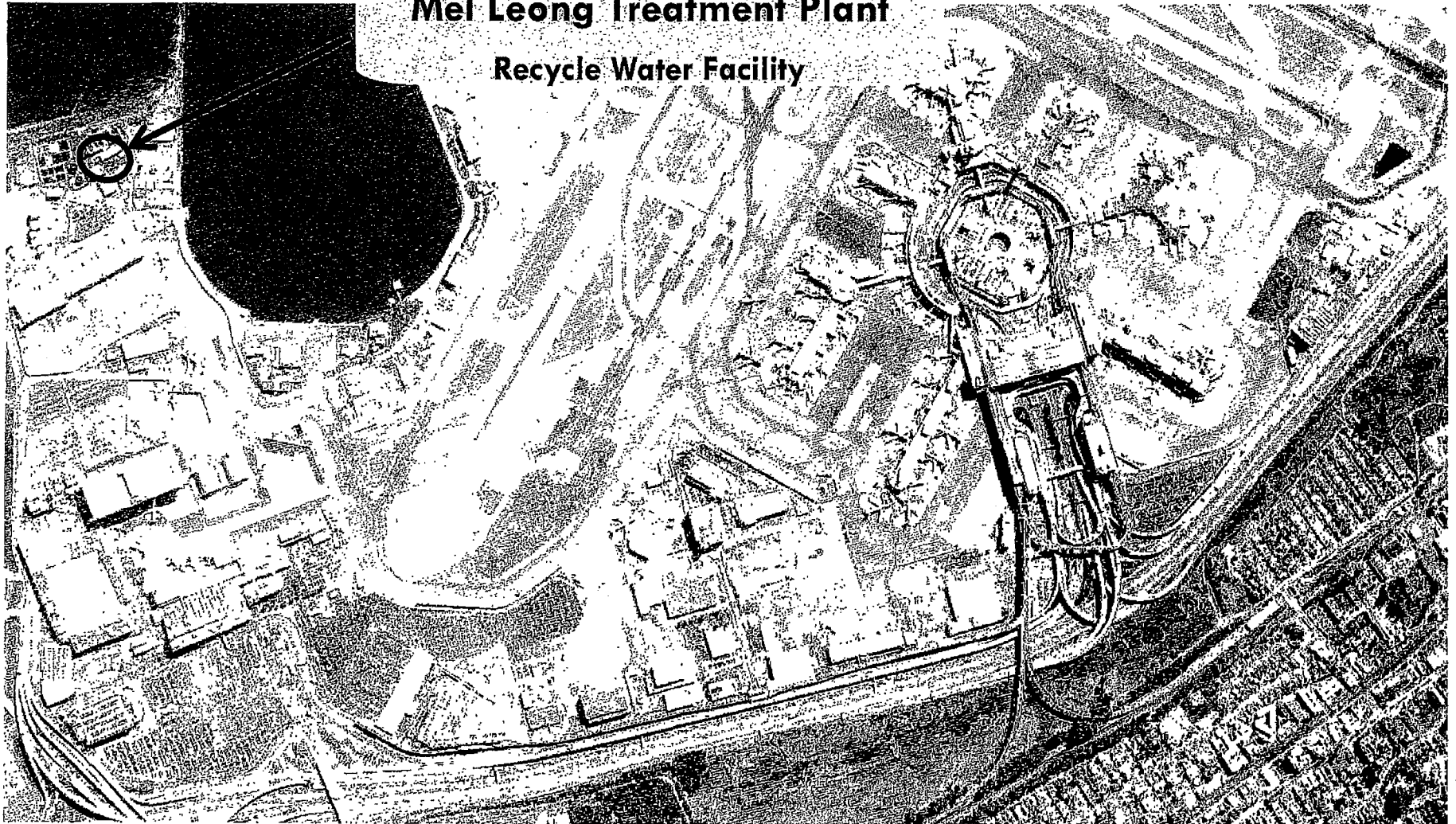
MEL LEONG TREATMENT PLANT