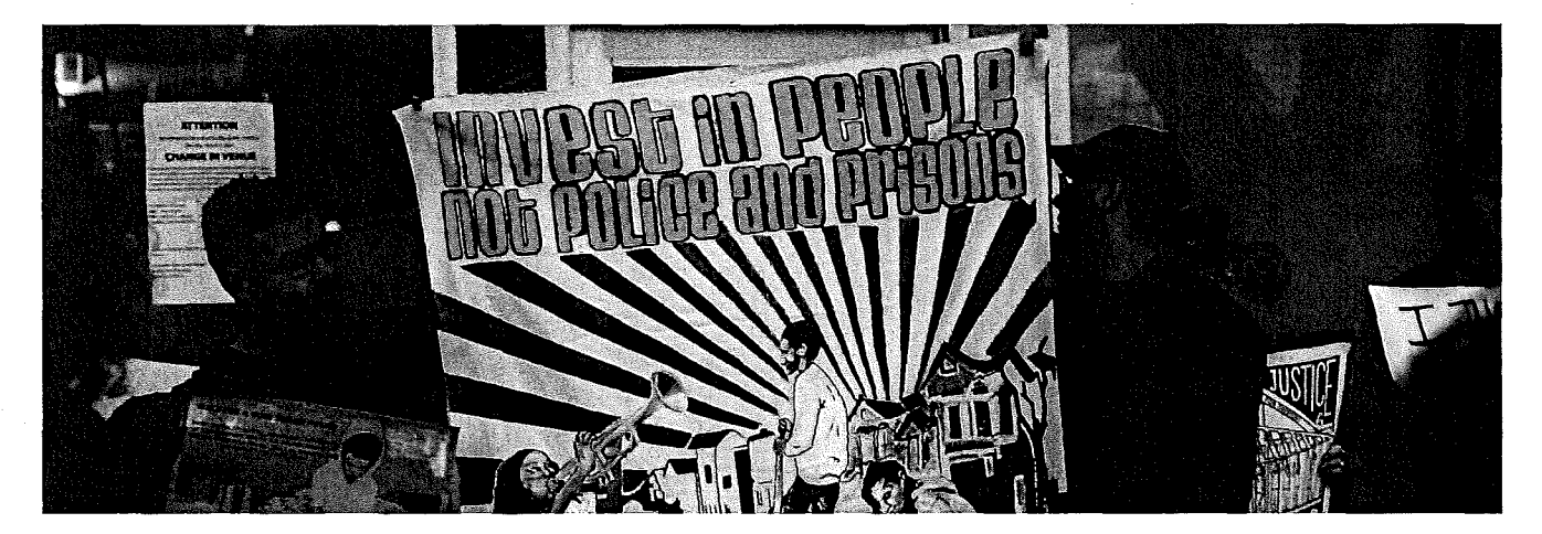
NO NEW JAIL IN SAN FRANCISCO

In SF and California, the public funds that are now used to police, convict and incarcerate people should be going to provide housing, education, health care & employment. People need mental health services, youth centers, supportive and affordable housing, and real opportunities in their communities; not cages.