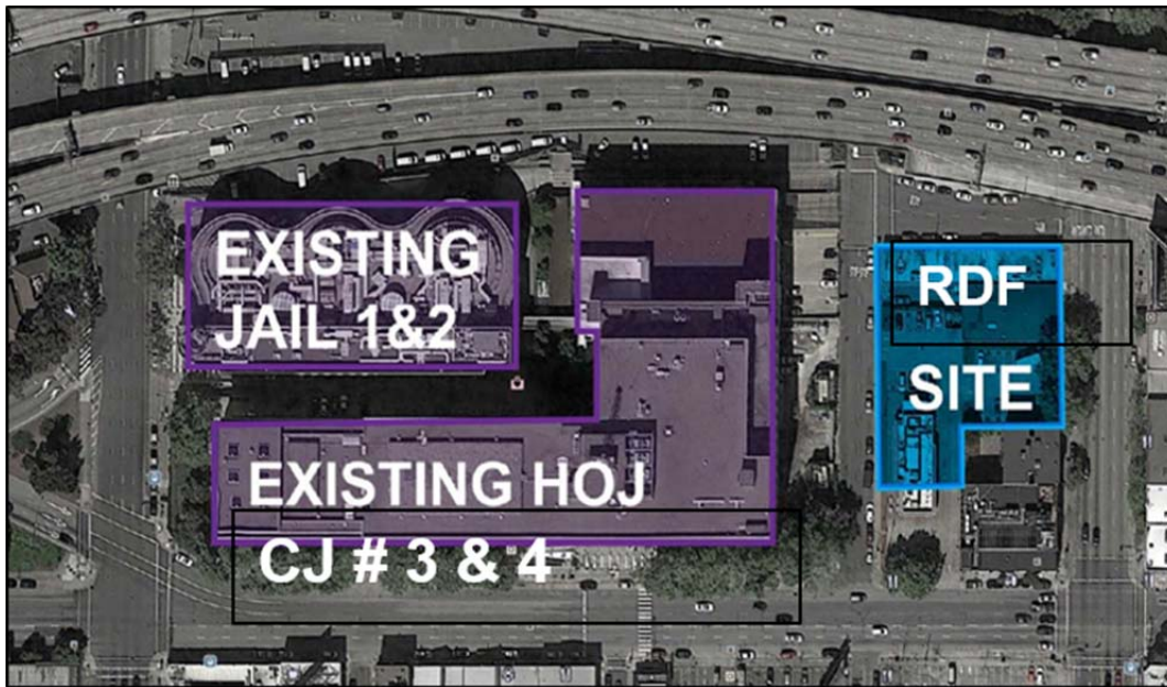
Exhibit: Hall of Justice and New Jail Facility Site Map

The City’s Real Estate Division is proposing to purchase four properties located at 814-820 Bryant Street, 444 6 th Street, 450 6 th Street and 470 6 th Street, adjacent to the HOJ to construct the replacement jail, as shown in the Exhibit below.