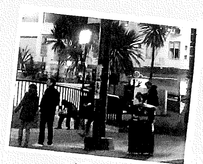
LED celebratory lighting