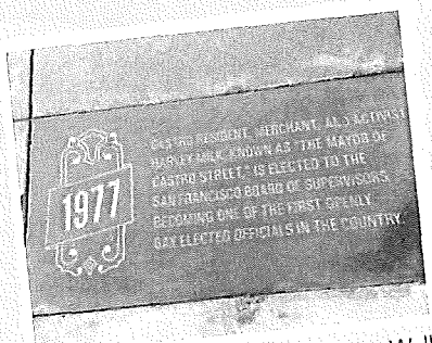
Castro History Walk