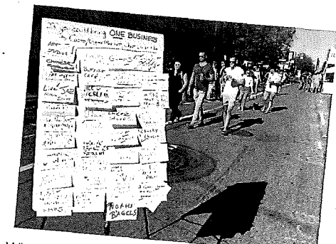
What do you want in the Castro?

learn more about the project visit: www.castroretail.com.