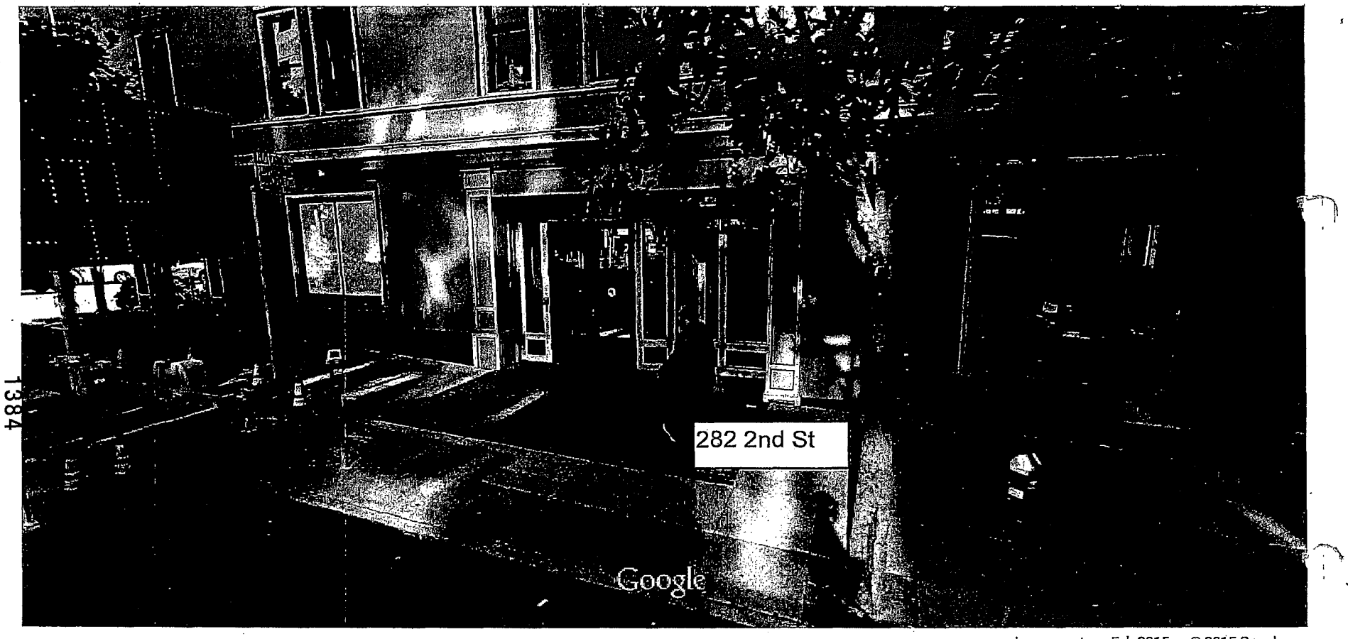
San Francisco, California Street View - Feb 2015